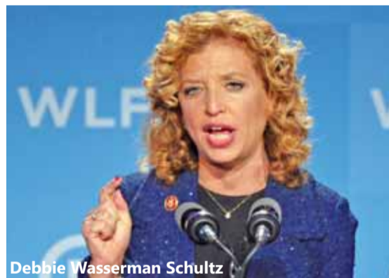
Debbie Wasserman Schultz

"What's in those emails show that it was a clear-