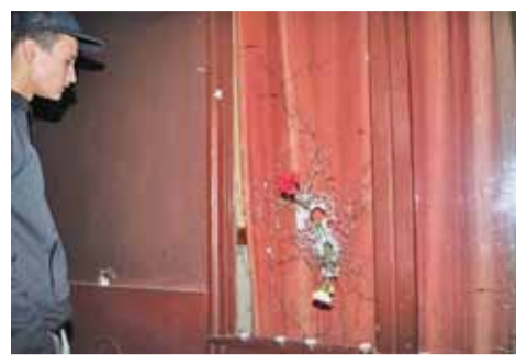
Bullet holes and flowers at Le Carillon, a bar in Paris where 12 people were killed in November 2015. (file photo)

The stark truth is that the Western political elite remains in denial, and not just about terrorism but about the anger and frustration over the effects of globalization, which have