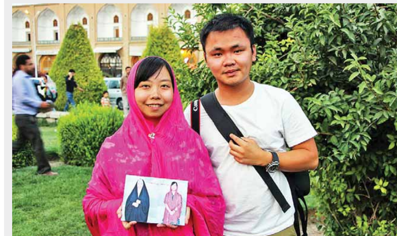
Foreign tourists welcomed "two-dimension photography" which was held at Imam square in Isfahan for a week with the goal of promoting hijab and dignity.