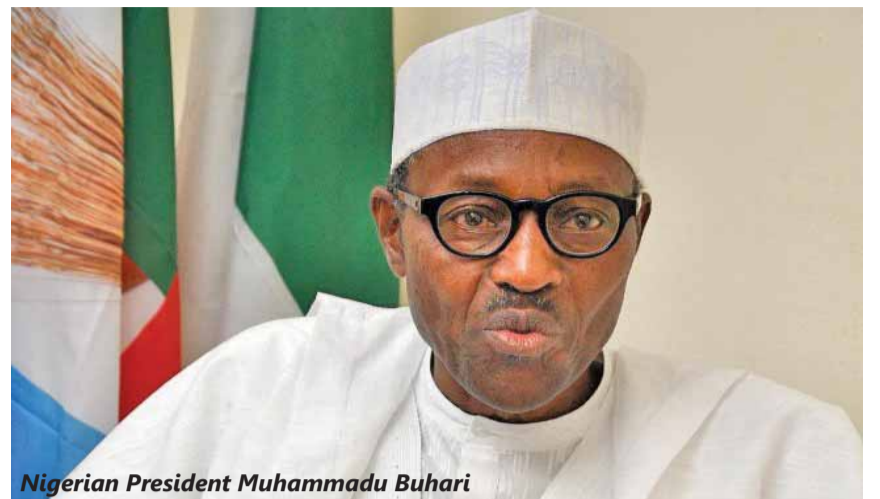
Nigerian President Muhammadu Buhari

The Nigerian official also expressed satisfaction over the removal of sanctions against Iran following the conclusion