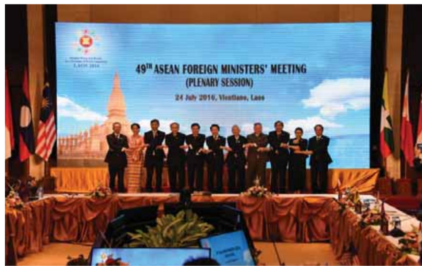
President Rouhani has said "expansion of political and economic ties with ASEAN is a goal of Iran's foreign policy."

signed in 1976 are mutual respect for the independence, sovereignty, equality, territorial integrity, and national identity of all nations, adaptation of a non-interference policy, peaceful settlement of disputes through peaceful tools, renunciation of the threat or use of force, and effective cooperation among member states.