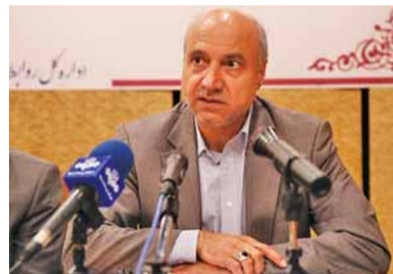
Iran to export gas to Iraq within a month Ramezani, elsewhere, announced that the Islamic Re-

He clarified that in the first phase of its exports, Iran will export 30 billion cubic meters of gas to Europe; however, up to 120 million cubic meters would be added to this figure in near future via implementing optimization projects.