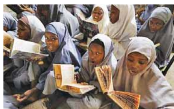
In this photo taken Wednesday April. 6, 2016 Muslim girls attend school in Kano, Nigeria. Nigerian girls have the right to wear the hijab headscarf to school, an appeals court has ruled in a country where suicide bombers have abused Islamic dress to hide their deadly weapons.

Africa's most populous nation of about 170 million people is almost equally divided between a mainly Muslim