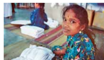
Of the 21 million in forced labour 70% are in forced labour exploitation and 22% are in forced sexual exploitation.

A key adviser to the United Nations children's agency on Wednesday decried the culture of impunity surrounding sexual violence against women and girls around the world, following a recent case of gang rape in India.