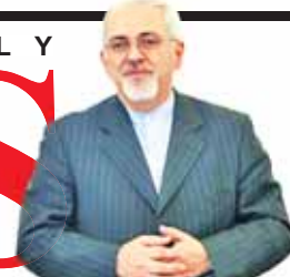
Zarif sees Iran-Bolivia ties at good level

16 Pages | Price 10,000 Rials | 38th year | No.12635 | Sunday | AUGUST 28, 2016 | Shahrvir 7, 1395 | Dhi Al Qaeda 25, 1437