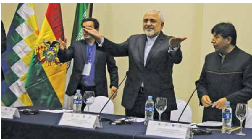
Iranian Foreign Minister Mohammad Javad Zarif during an economic conference in the Bolivian city of Santa Cruz

Bolivian Foreign Minister David Choquehuanca Céspedes, for his turn, said that the conference is a good opportunity for the Iranian and Bolivian corpora-