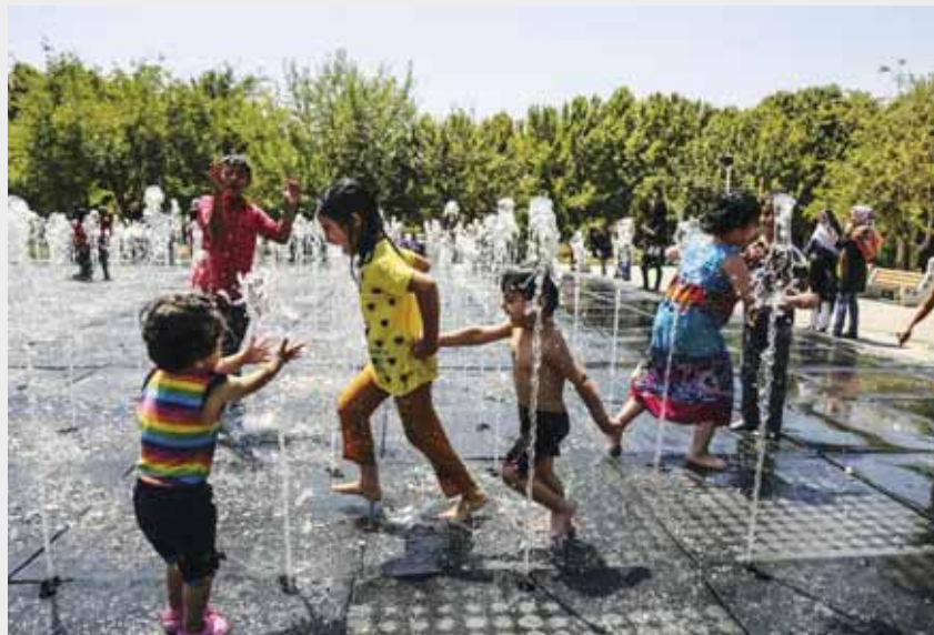
On a hot summer day children are playing in spraying pools in the city of Isfahan.