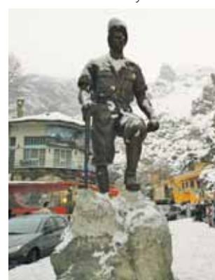
A view of Darband during the winter time