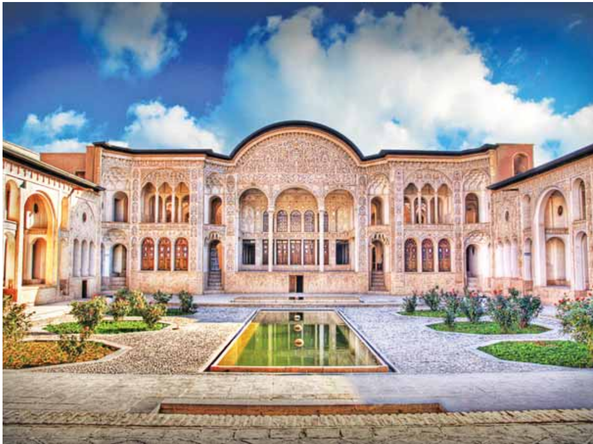
A view of Tabatabaei House located in the central city of Kashan. The historic merchant house is renowned for its intricate stone reliefs, fine stucco and lavish mirror and stained-glass work.

According to another agreement signed between CHTHO and German hospitality company, Steigenberger Hotel Group in late May, the company is set to build 10 hotels in different parts of Iran over the next ten years.