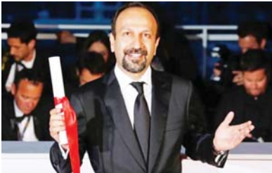
Director Asghar Farhadi, Best screenplay award winner for the film “Forushande” (The Salesman), poses during a photocall after the closing ceremony of the 69th Cannes Film Festival in Cannes, France, May 22, 2016.

“We would like to express our unanimous and emphatic disapproval of the climate of fanaticism and nationalism we see today in the U.S. and in so many other countries, in parts of the population and, most unfortunately of all, among leading