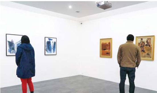
Art enthusiasts visit an exhibition of landscapes by several modern Iranian painters at Tehran's Mah-e Mehr Gallery on February 24, 2017.