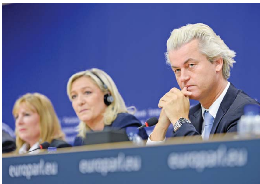
Marine Le Pen (C) and Geert Wilders (R)

In the UK's Brexit referendum and the U.S. presidential election, voters from large metropolitan areas overwhelmingly supported “Remain” and Hillary Clinton, respectively. We will likely see a similar