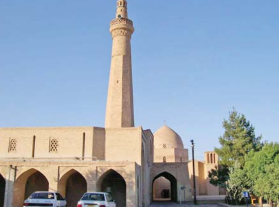
A view of Fahraj congregational mosque in Yazd province

The term jameh mosque (or masjid jami) or collective mosque is referred to a large center of community worship and a site for Friday prayer services in Islamic countries