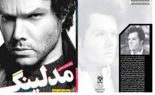
The cover of Iranian model Amir Zobdeh's book "A Practical Instruction for Modeling"

He noted that the book is informative and readable for people from all walks of life.