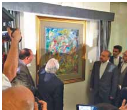
Master miniaturist Mahmud Farshchian (C) speaks during the unveiling ceremony of his new works at the Farshchian Museum of Tehran's Sadabad Cultural Historical Complex on May 14, 2016.

He added that the idea of his second tableau "Environ-