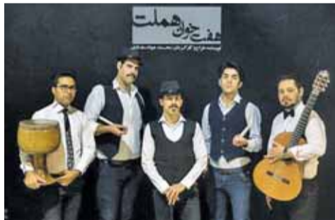
A poster for "Seven Labors of Hamlet"

"Seven Labors of Hamlet" was formed in a long process of 15 months of numerous workshops and rehearsals. The outcome was that we learned that 'Hamlet' has the potential to