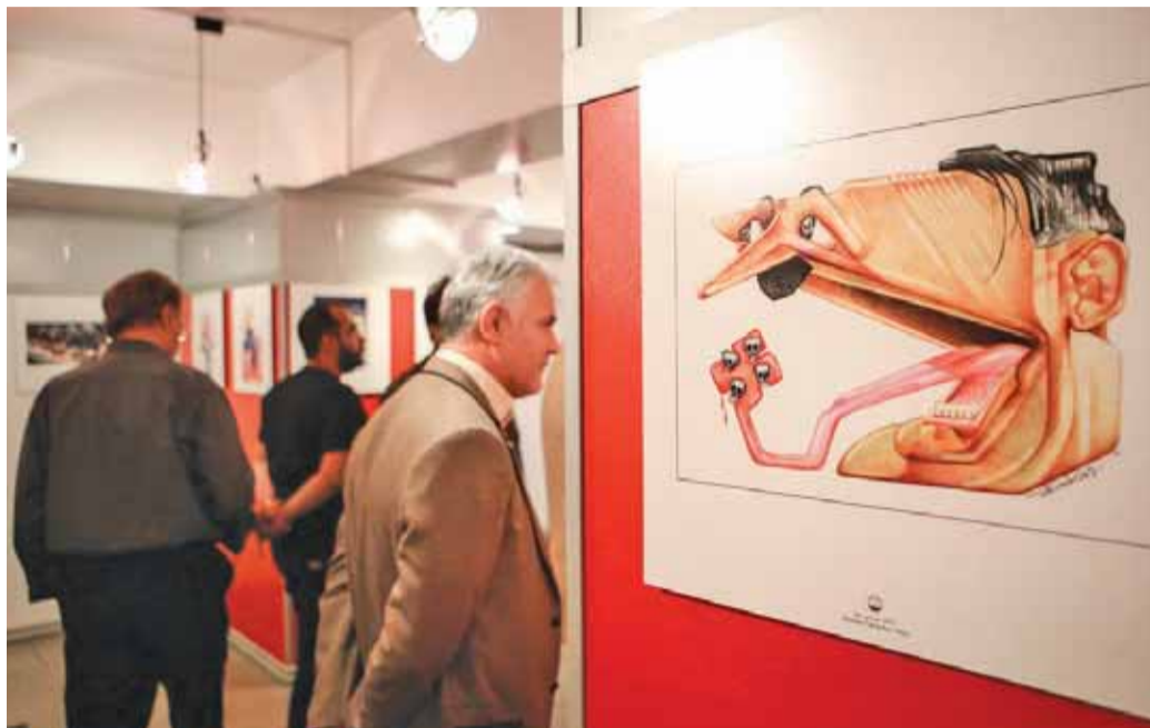
Art fans visit the 2nd International Holocaust Cartoons Contest opened at Tehran's Art Bureau on May 14, 2016.

The first place winner in the cartoon section will receive a cash prize of $12,000, with those in second