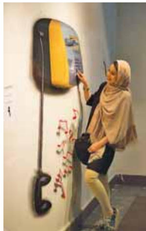
A woman poses with a 3D painting during an exhibition at the Khiale No Gallery of the Saba Art and Cultural Institute in Tehran on May 12, 2016.

The exhibition will run until May 19 at the institute located near the intersection of Taleqani and Vali-e Asr.