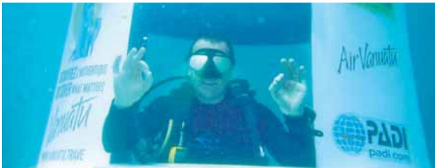
Mail a waterproof postcard at an underwater post office in hideaway Island, Vanuatu

creator of the Museo Subacuático de Arte in Cancún and the Molinere Underwater Sculpture Park in Western Grenada – is back at it again, this time with Europe's premier underwater museum: Museo Atlantico. The newly-sunk displays include the Raft of Lampedusa, a haunting lifeboat piled with 13 hyperrealistic refugees, and The Rubicon, 35 figures frozen in time, walking towards a wall that the artist calls a point of no return (climate change, anyone?).