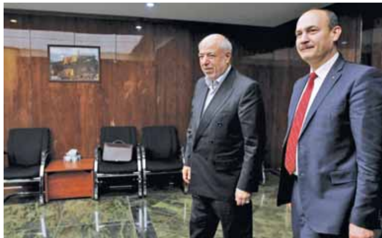
Tunisian Minister of Energy and Mines Mongi Marzouk (R) visited Iranian Energy Minister Hamid Chitchian in Tehran on Saturday.

nian companies in this regard could strengthen the economic relations between the two countries "he added.