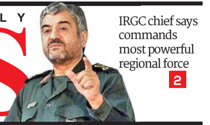
IRGC chief says commands most powerful regional force

16 Pages | Price 10,000 Rials | 38th year | No.12682 | Thursday | OCTOBER 27, 2016 | Aban 6, 1395 | Muharram 25, 1438