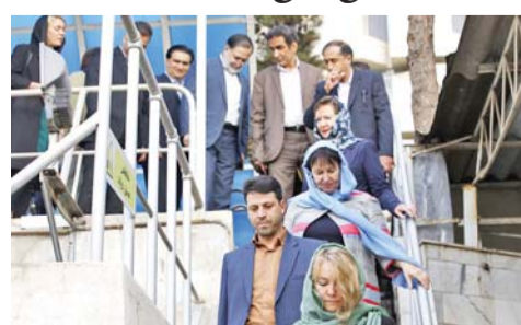
Melanie Schultz van Haegen is paying a visit to a water treatment plant in southern Tehran

"Dutch companies are prepared to cooper-