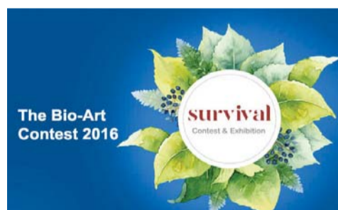
science Company and the Gwacheon National Science Museum.

"Survival" was the central theme of the contest, which is jointly organized by the Medicinal Bioconvergence Research Center (Biocon) at the Seoul National University, the Seoul Bio-