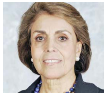
They have also shown her close ties to Wall Street and the

A: There is still three weeks until the election. A lot could happen in three weeks. Already the divulgence of some of Hilary Clinton's e-mails have raised questions about her pro-