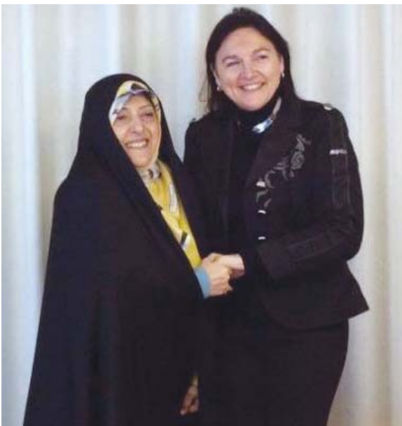
Masoumeh Ebtekar (L) and Marie Christine Marghem

The MOU will be valid for a period of five years and, accordingly, a joint working group will follow up on the progresses made under the terms of the agreement.