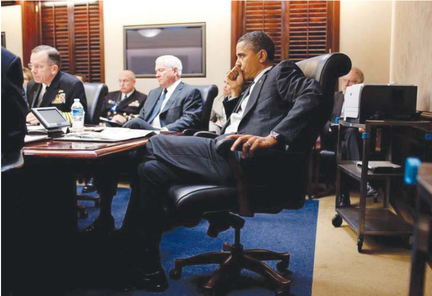
President Barack Obama listens during a terrorism threat briefing in the Situation Room of the White House.

Moreover, the low number of terrorism deaths is unlikely to be the result of security measures. There have been scores of terrorist plots rolled up by authorities