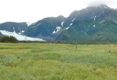
Photos of Alaskan Pedersen Glacier, in 1930s and 2005 which indicate the dramatic and negative effects of climate change.

The reality of climate change is an open question, President-elect Donald Trump said in an interview aired Sunday.