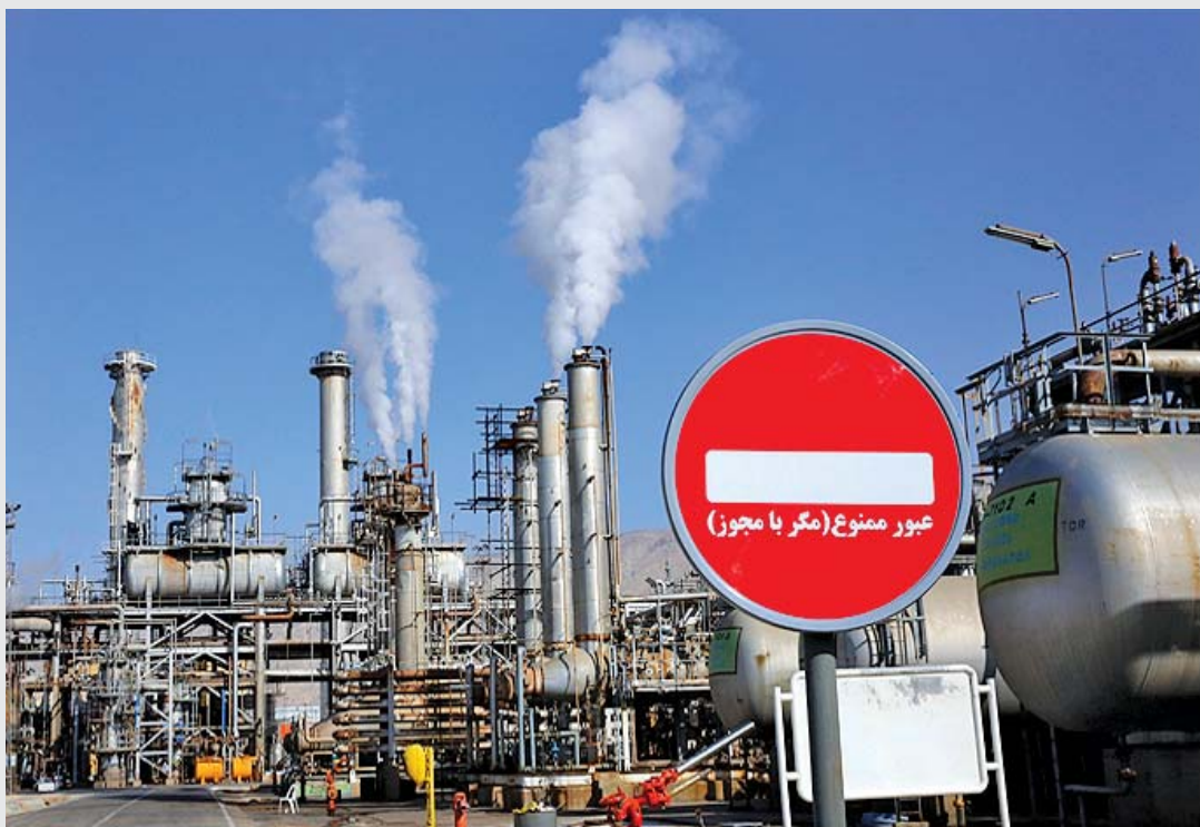
Based in the southern Bushehr province, Iran's Fajr Jam Gas Refinery has a daily refining capacity of 125 million cubic meters of gas. The refinery is responsible for supplying 15 percent of the country's gas needs.