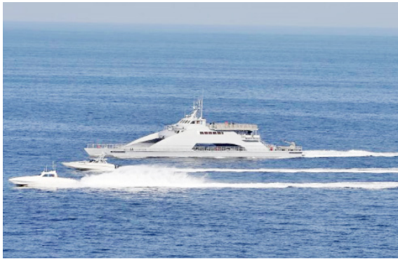
IRGC speed boats are seen near the USS John C. Stennis CVN-74 (not pictured) as it makes its way to the Persian Gulf through the Strait of Hormuz, December 21, 2018.

Iran's President Hassan Rouhani recently warned that if the country cannot sell its oil due to U.S. pressure, then no other regional country will be allowed to do so either, a threat which many have taken as meaning to block the strategic Strait of Hormuz in the Persian Gulf.