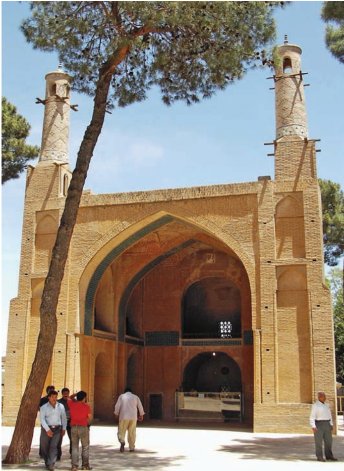
People visit Menar Jonban, a tourist destination in Isfahan, central Iran.

Used to be one of capitals of the mighty Safavid Empire, Isfahan is a top tourist destination for good reasons. Unlimited visual appeals such as tree-lined boulevards, Persian gardens and majestic Islamic buildings has named the city a living museum of traditional culture.