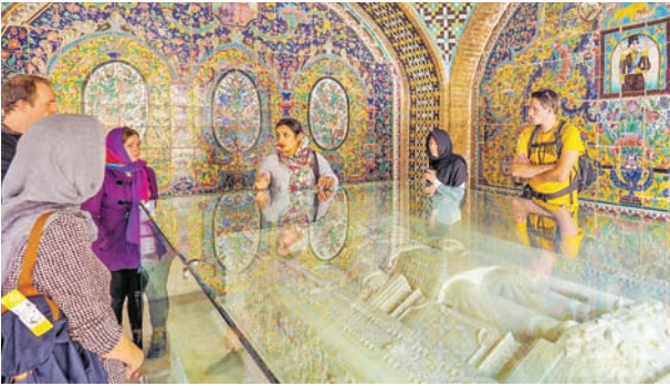
Foreign travelers visit UNESCO-registered Golestan Palace in downtown Tehran.

TOURISM d e s k TEHRAN — Iran tourism chief has proposed people from across the world to opt the country for spending Christmas vacation this year.