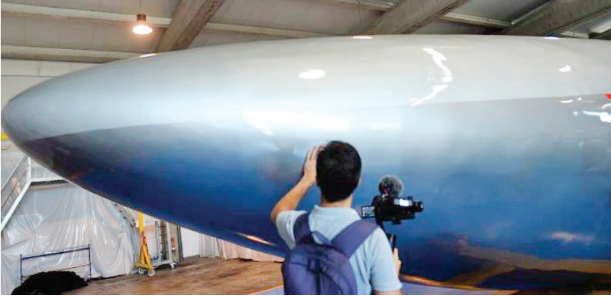
A man touches the rear of a full-scale passenger Hyperloop capsule unveiled by Hyperloop Transportation Technologies on October 2, 2018 in El Puerto de Santa Maria.

Hyperloop is a form of transportation that uses magnetic levitation to float vehicles above