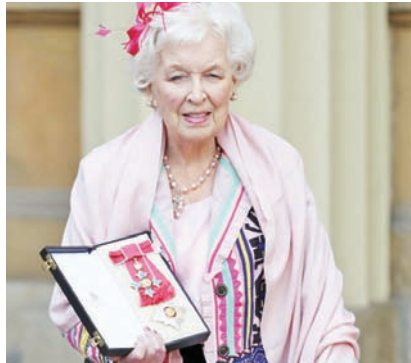
Nov. 16, 2017 file photo of Dame June Whitfield after she was made a dame. British actress and comedic star June Whitfield, whose long career included memorable roles in TV series "Absolutely Fabulous" and "Terry and June," has died. She was 93.

Revenues in North America dropped 5.2 percent compared to the same weekend in 2017, according to Comscore, though that's because last year benefited from the release of "Star Wars: The Last Jedi." Even so, the domestic market is up almost 7 percent from last year and over 4 percent from 2016's record bounty. As of this weekend, ticket sales have surpassed $11.8 billion.