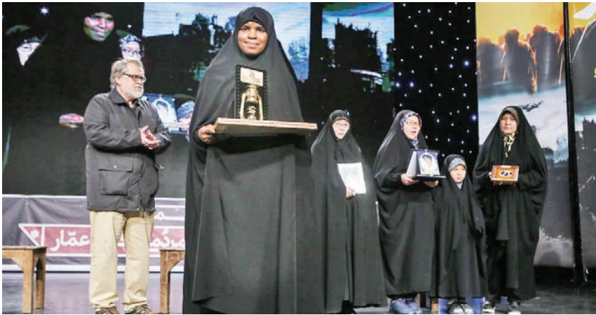
Daughter of Nigerian Shia leader Ibrahim Zakzaky holds a Golden Lantern she received from the 9th Ammar Popular Film Festival (APFF) on behalf of her father at Tehran's Andisheh Hall on December 30, 2018.