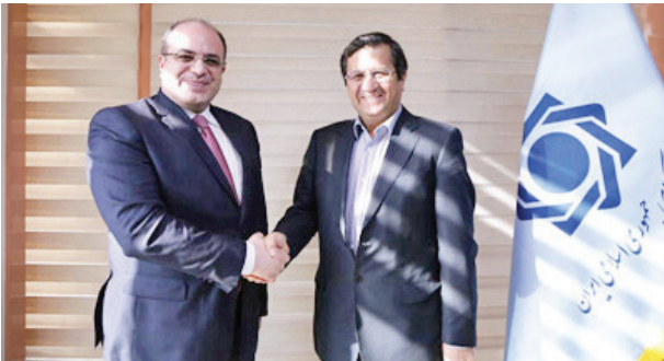
Central Bank of Iran Governor Abdolnaser Hemmati (R) and Syrian Minister of Economy and Foreign Trade Mohammad Samer al-Khalil met in Tehran on Monday.

1 → The agreement was signed by Iranian Transport and Urban Development Minister Mohammad Eslami and Samer al-Khalil at the place of Iran Chamber of Commerce, Industries, Mines and Agriculture (ICCIIMA). The Syrian minister, for his part, underlined the important role of the central banks of the two countries to facilitate trade ties in line with materializing the objectives of the agreement.