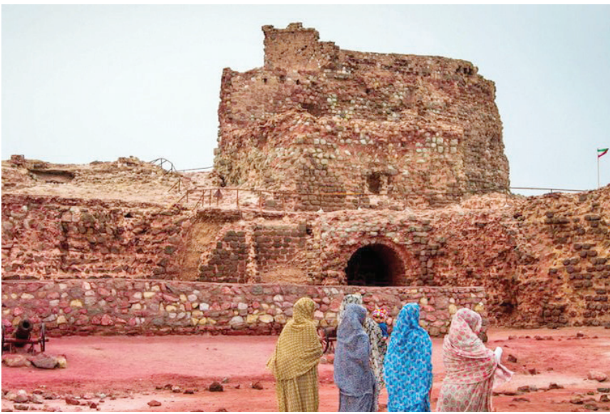
People tour the Portuguese Castle of Hormuz in the Persian Gulf

rugged mountains all surrounded by the blue waters of the Persian Gulf.