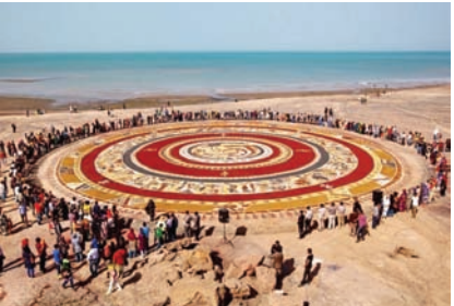
Hormuz Island is teemed with colorful soil used as a kind of spice by the locals

In addition, upper levels of fort offers wonderful views of the island, its village,