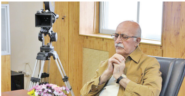
Iranian documentarian Kamran Shirdel in an undated photo.

"The Mirrors", "Tehran Is the Capital of Iran", "Women's Quarter", "Women's Prison" and "Boom-e Simin" are among the films.