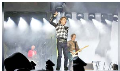
Singer Mick Jagger performs during the kick-off show of the Rolling Stones' "No Filter" tour at Soldier Field in Chicago, Illinois, U.S. June 21, 2019.

"He (Jagger) went through it very easily," Stones guitarist Keith Richards told the Toronto Sun in an interview ahead of the Chicago concert. "He's in great shape — rocking. As I say, it seemed to be no