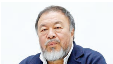
Chinese artist Ai Weiwei attends a news conference for his exhibition "Everything is art. Everything is politics" displayed at Kunstsammlung Nordrhein-Westfalen in Dusseldorf, Germany, May 16, 2019.

Ai, who was detained for nearly three months in his homeland in 2011 and is known for his criticism of Communist-run China's stifling of free expression, hinted that his "Turandot" will not pull any punches.