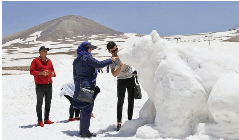
A participant works on a sculpture during the 2nd edition of the Ice and Snow Sculpture Festival in the Tochal ski resort in Tehran on June 21, 2019.

A R T TEHRAN — The winners of the 2nd Tochal Ice and Snow Sculpture Festival were announced during a ceremony in Tehran's Tochal ski resort on Friday.