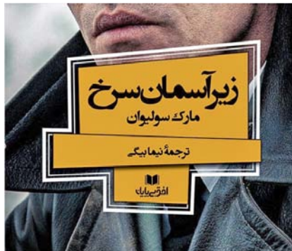
Front cover of the Persian version of American author Mark T. Sullivan's "Beneath a Scarlet Sky".

The 10th edition of the Ammar festival was held in Tehran from January 1 to 10.