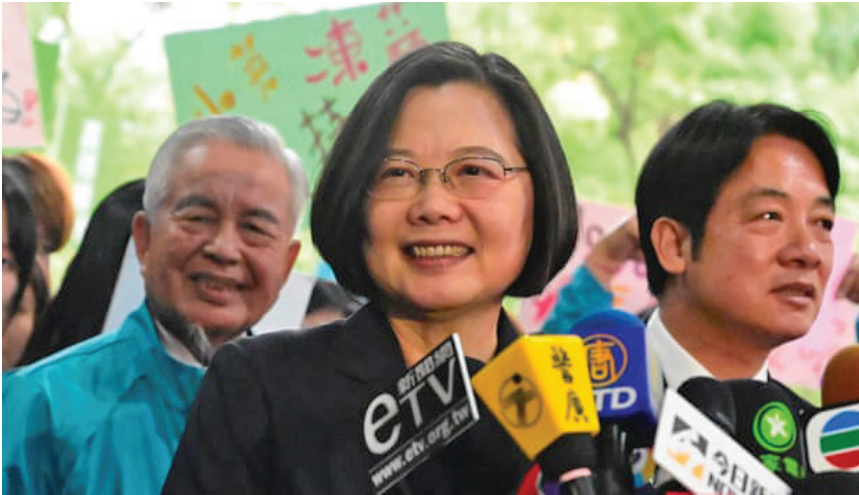
Taiwan’s President Tsai Ing-wen