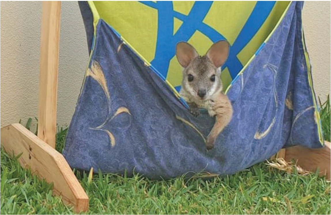
photos of the bats using wraps she sewed.