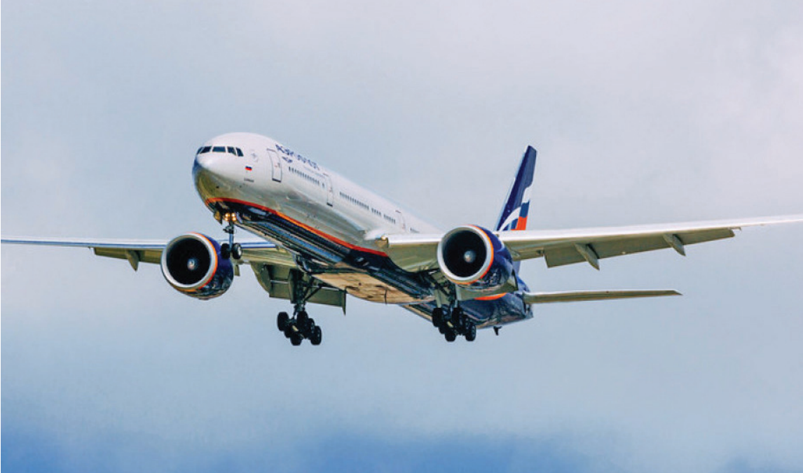
Aeroflot completed a round trip from Moscow to Tehran hours after other airlines canceled or diverted flights.

Aeroflot operated three flights from Moscow to Dubai Wednesday, while the airline's low-cost subsidiary Pobeda also flew to Dubai across Iranian airspace as scheduled. Regional airline S7 operated a regular flight from Russia's third largest city Novosibirsk to Dubai, also across Iran,