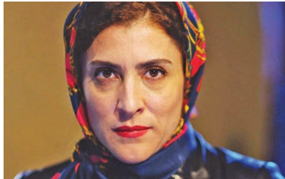
Actress Vishka Asayesh.

The Sundance Film Festival, the largest U.S. independent film event, will take place from January 23 to February 2.