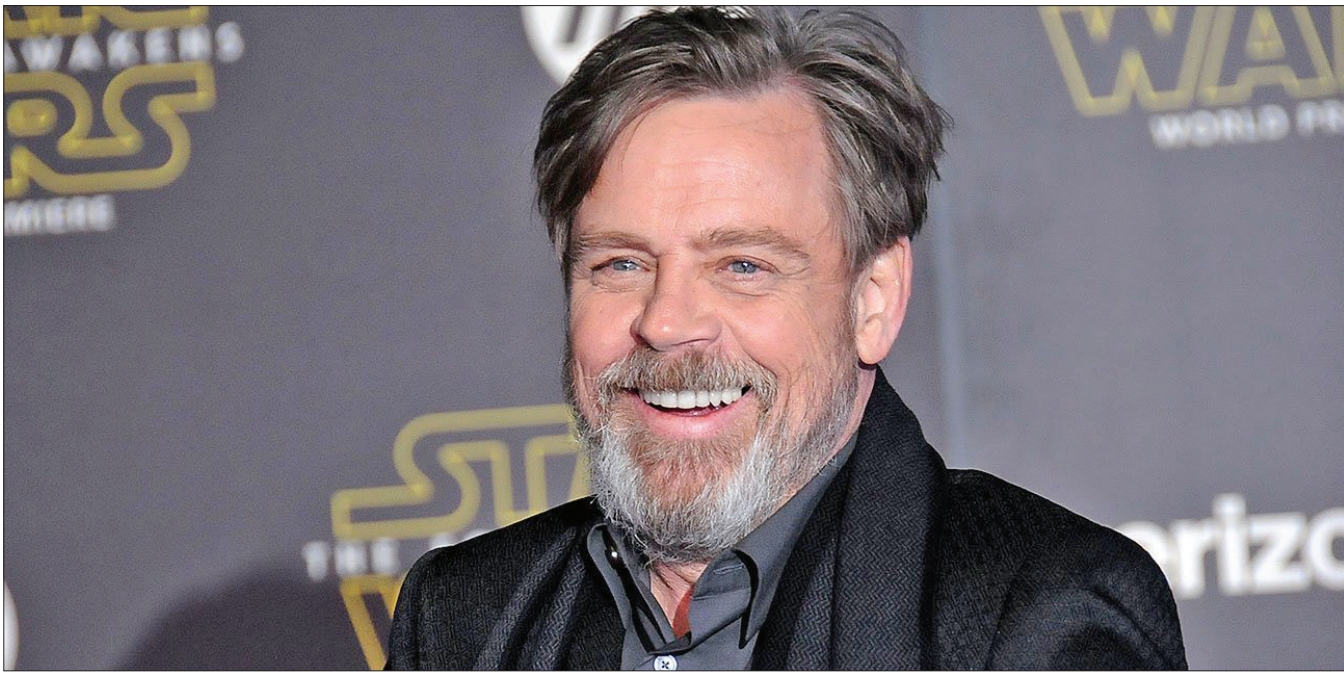
Mark Hamill

Hamill's remarks also mocked Trump's threat to target Iranian cultural sites in case Iran retaliated for the assassination of Lieutenant General Qassem Soleimani.