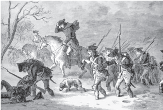
Gen. George Washington’s army marches to Valley Forge, Pennsylvania in 1777.

Experts from across the country, including the University of Connecticut, Quinnipiac University, Yale University, the University of Florida and the University of California, Santa Cruz, are planning to study the remains. The bones and teeth