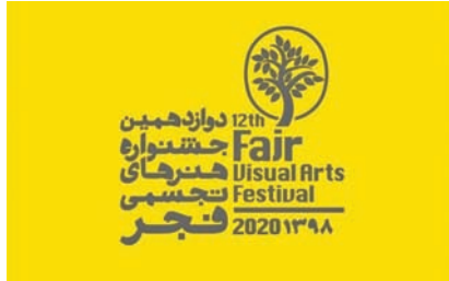
A poster for the 12th Fajr Festival of Visual Arts.

On Saturday morning, the Armed Forces General Staff released a statement noting that human error in an air defense mistakenly targeted the Ukrainian passenger plane near