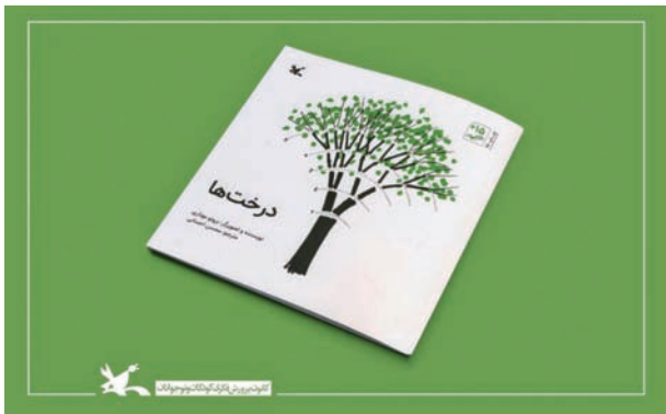
A copy of the Persian version of Italian artist Bruno Munari's book "Drawing a Tree".

CULTURE TEHRAN — A Persian translation of Italian artist Bruno Munari's book "Drawing a Tree", which was first published in Iran in 1985, is now in its 15th edition, the Institute for the Intellectual Development of Children and Young Adults, which is the publisher of the book, announced on Sunday.