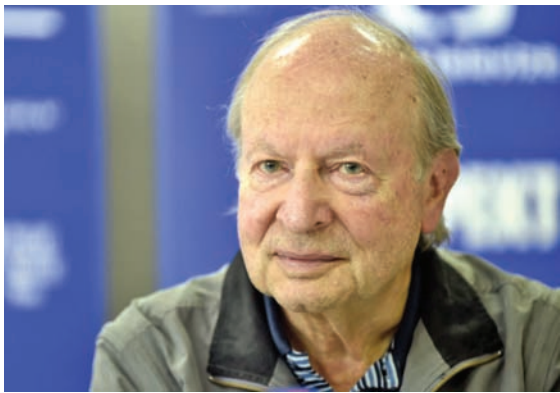
Ivan Passer in 2016.

However, the events of the Prague spring in 1968, which culminated in an invasion by Warsaw Pact forces in August