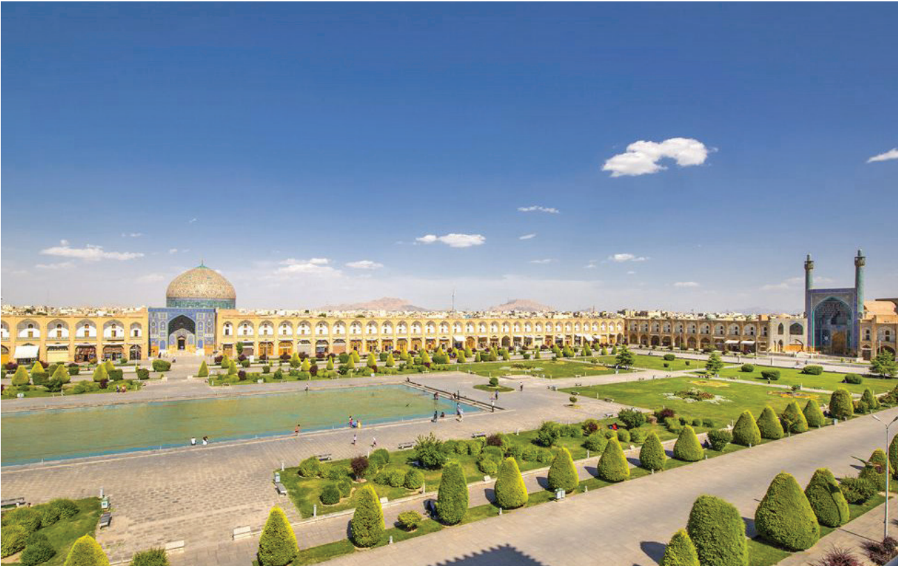
One of the largest city squares in the world, Naqsh-e Jahan Square (Pattern of the World Square), is in the city of Isfahan, built in the early 17th Century.

However, neither Russian travelers were reportedly calling off their Iran trips nor airlines the flights passing through Iranian airspace following the deadly Ukrainian