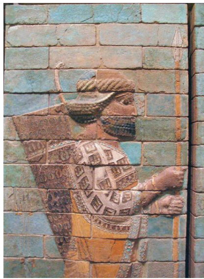
Ceramics depict Persian soldier (“immortal”), Susa; ca. 500 BC

➔ 1 Part of Susa is still inhabited as Shush, Khuzestan province on a strip of land between the rivers Shaour (a tributary of the Karkheh) and Dez.