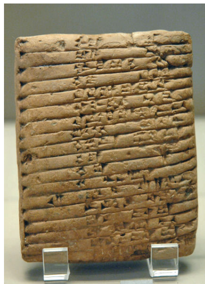
Clay tablet shows a list of Awan kings; Susa; ca. 2400 BC–ca. 2000 BC

We can catch a glimpse of the beauty of the city in some of the scenes of the Biblical book of Esther, the story of which is situated in Susa, at the court of king Ahasverus (Xerxes). Unfortunately, a