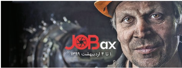
A poster for the 1st Iran International Job Photo Competition.

The International Job Photo Competition aims to highlight the job as an important social topic through pictures depicting the reality of a job.