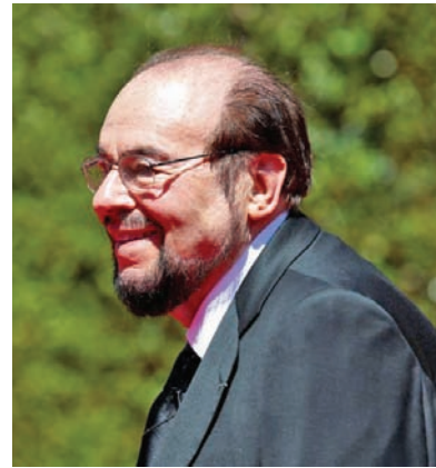
James Lipton poses at the 2014 Creative Arts Emmy Awards in Los Angeles, California August 16, 2014.

His interviews ended with a list of rapid fire questions, including “If heaven exists, what would you like to hear God say when