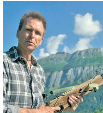
This image released by CBS shows host Phil Keoghan in a scene from last season’s competition series “The Amazing Race.”

Disneyland and Universal Studios Japan announced closures, and events that were expected to attract tens of thousands of people, including a concert series by the K-pop group BTS, were called off.