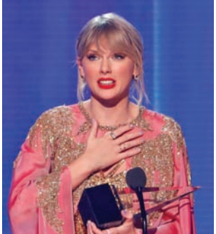
2019 American Music Awards - Show - Los Angeles, California, U.S., November 24, 2019 - Taylor Swift accepts the Artist of the Year award.

LOS ANGELES (Reuters) — Pop superstar Taylor Swift topped the list of the world’s best-selling music artists in 2019, thanks to the success of her album “Lover,” beating popular acts including Korean pop sensation BTS, recording industry group IFPI said on Monday.