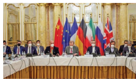
Plan of Action (JCPOA).

After submitting the response, Iran continued its internal consultations. The Supreme National Security Council hosted a meeting of the members of Parliament's National Security and Foreign Policy Committee on Tuesday. Ali Shamkhani, Amir Abdollahian, and Ali Bagheri Kani attended the meeting. And on Wednesday, a closed session of Parliament was held with the same officials to discuss the situation around the talks in Vienna over reviving the 2015 nuclear deal, officially known as the Joint Comprehensive