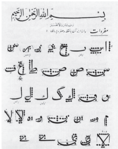
Naskh, individual letters and their measurements in points, zeroes, and lines.

After Ebn Moqla other calligraphers gradually elaborated these principles and formulated them