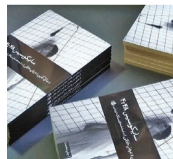
Copies of the Persian edition of Sarah Kane's play “4.48 Psychosis”.

Sarah Kane's plays deal with themes of redemptive love, sexual desire, pain, torture – both physical