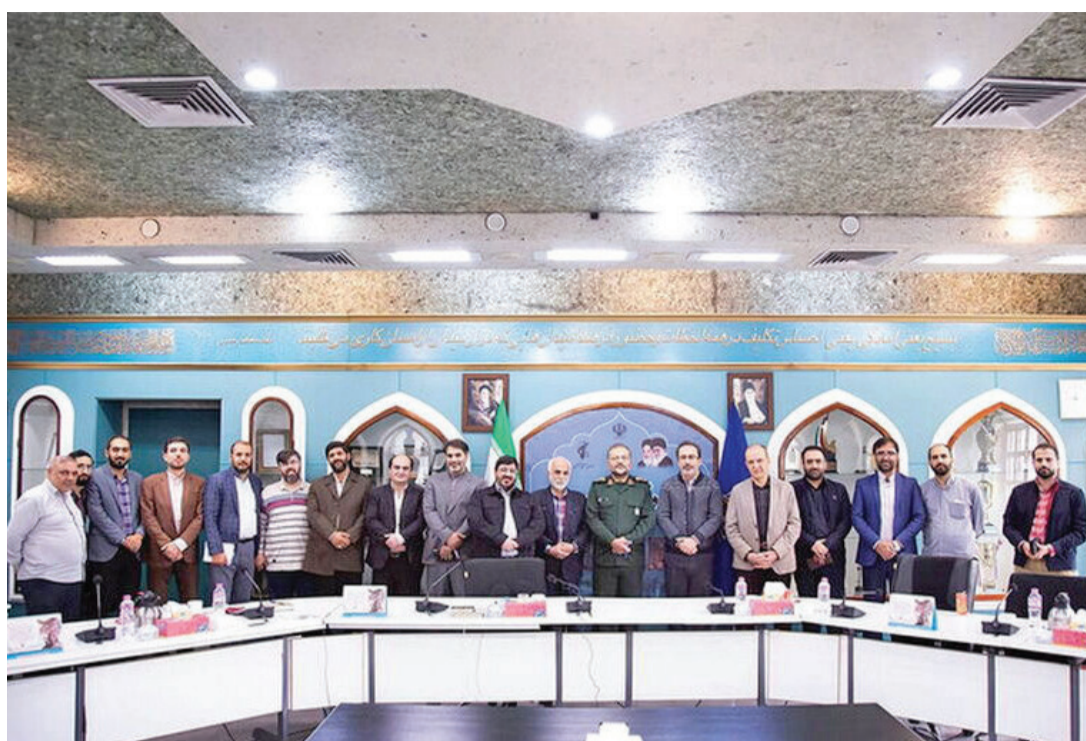
Organizers of the 17th International Resistance Film Festival pose after holding a meeting in Tehran on November 4, 2022 to discuss issues on the event.

It is set in Shiraz, a town which evokes images of Persepolis and pre-Islamic monuments, the great poets, the shrines, Sufis and