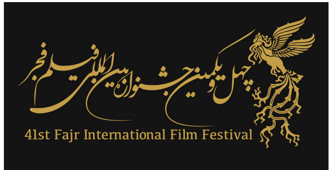
41st Fajr International Film Festival

Following the management changes in the Cinema Organization of Iran in 2021, the new director of the organization, Mohammad Khazaei, ordered that the Fajr national and international film festivals be combined again for 2022.