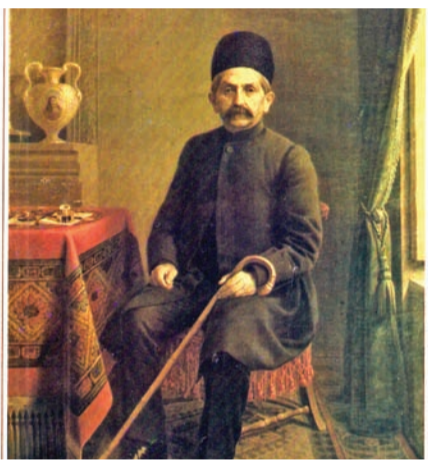
Portrait of Haji Aliqoli Khan Sardar-As'ad Bakhtiari.

A number of Kamalolmolk's friends were among the founding members of the Lodge, including Mohammad-Ali Foroughi Zoka' al-Molk and Ebrahim Hakimi Hakimi al-Molk.