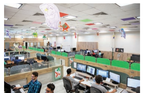
This file photo shows Iranian animators working at a studio of the Institute for Intellectual Development of Children and Young Adults – Kanoon.

"Iran has not done well on efficiently training human resources in this field, and the