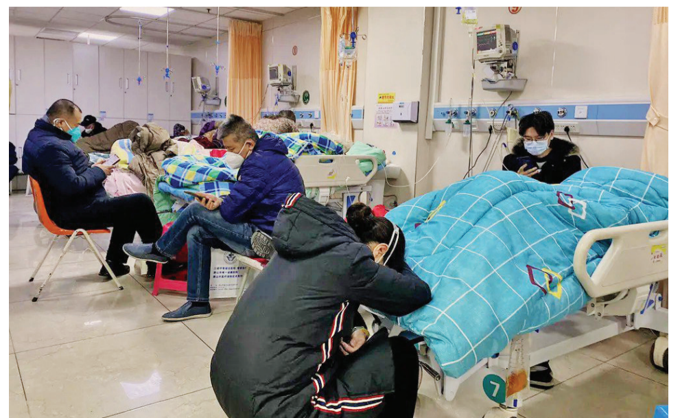
Patients with Covid-19 lie in beds at Tangshan Gongren hospital, Tangshan, China

"Following their meetings, let us get together as the leaders. I offered this to Mr. Putin and he received it positively. Thus, a series of contacts would be launched," he said, referring to a Dec. 11 phone call between the two leaders.