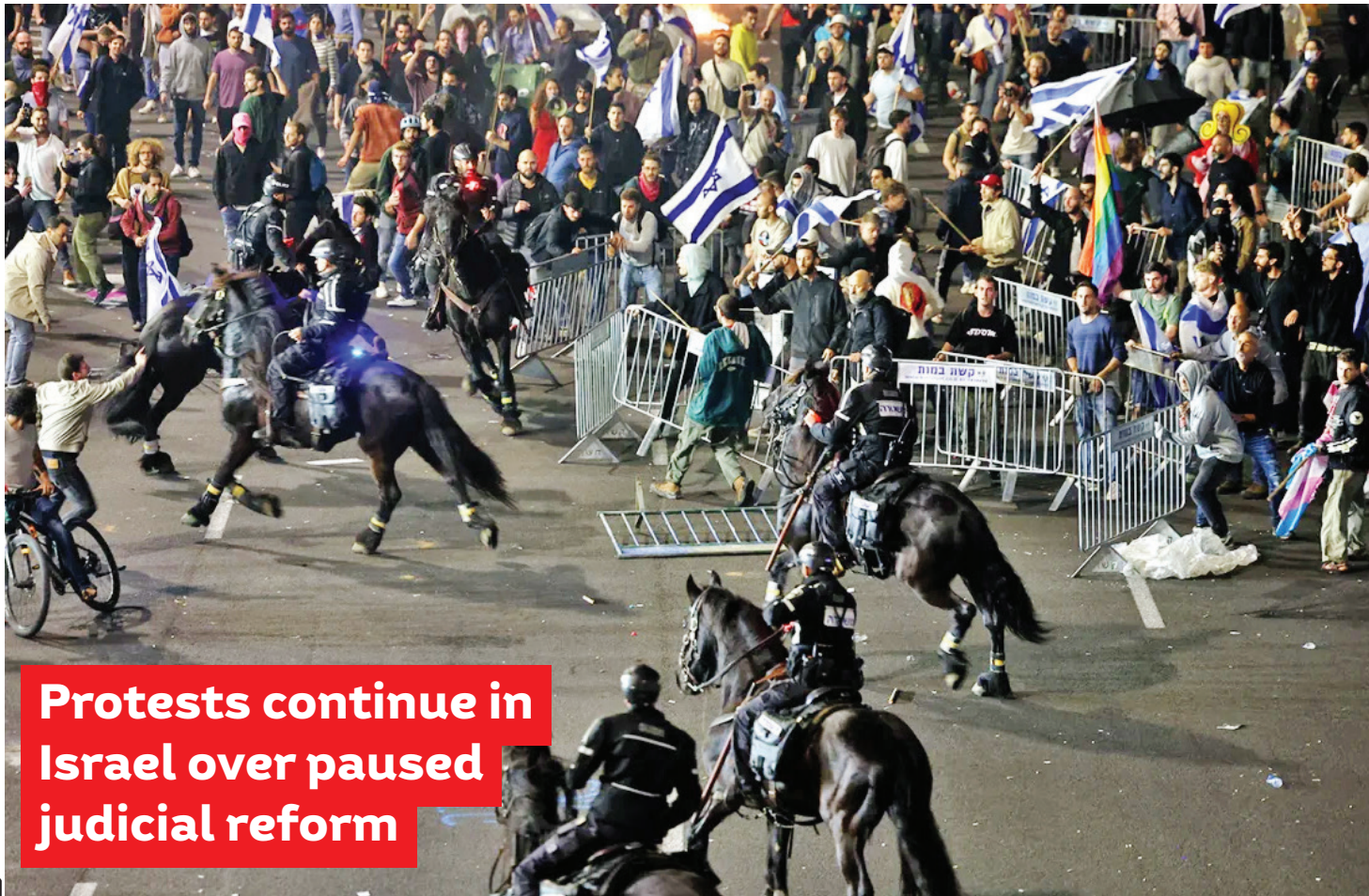
Protests continue in Israel over paused judicial reform

Mesigar was selected the Most Valuable Player of the 2023 AFC Beach Soccer Asian Cup.