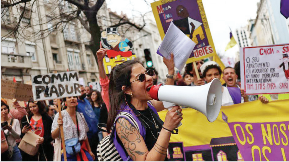
Demonstrators parade holding signs and a Portuguese flag during the "Casa Para Viver" (A House to Live In) protest on April 01, 2023 in Lisbon, Portugal. Demonstrations for the right to housing are held in Lisbon, Porto, Viseu, Aveiro, Coimbra and Braga to protest the increase in house prices while wages have stagnated or have decreased.