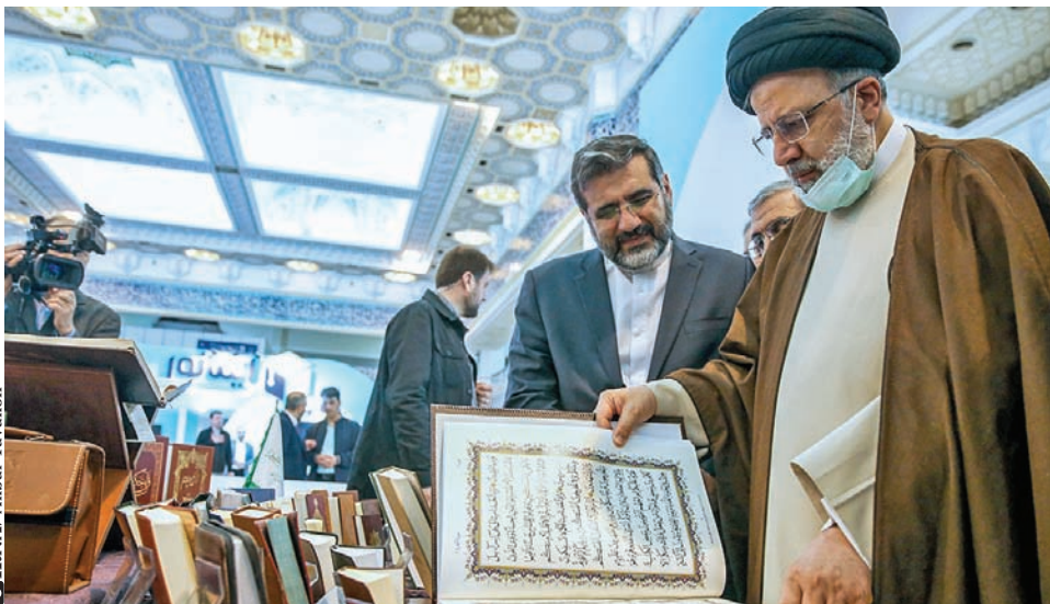
30th Intl. Holy Quran Exhibition opens in Tehran

"The U.S. said the economic pressures they've put on Iran are unprecedented in history. Despite all their lies, they were true to this," the Leader added. ▶ Page 7