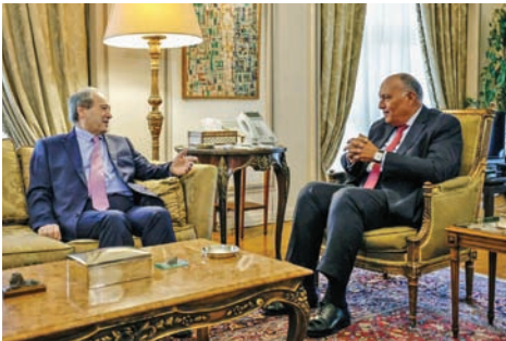
Egyptian and Saudi Arabian mediation.

An Egyptian security source, speaking on condition of anonymity, told Reuters that the visit will help put in place steps to return Syria to the Arab League through