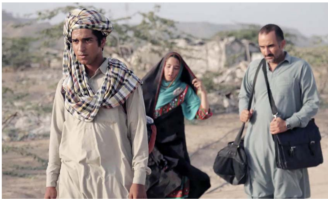
A scene from "Endless Borders" by Iranian director Abbas Amini

"Black Stone" follows a documentary crew as they film civil servants who are absent from their