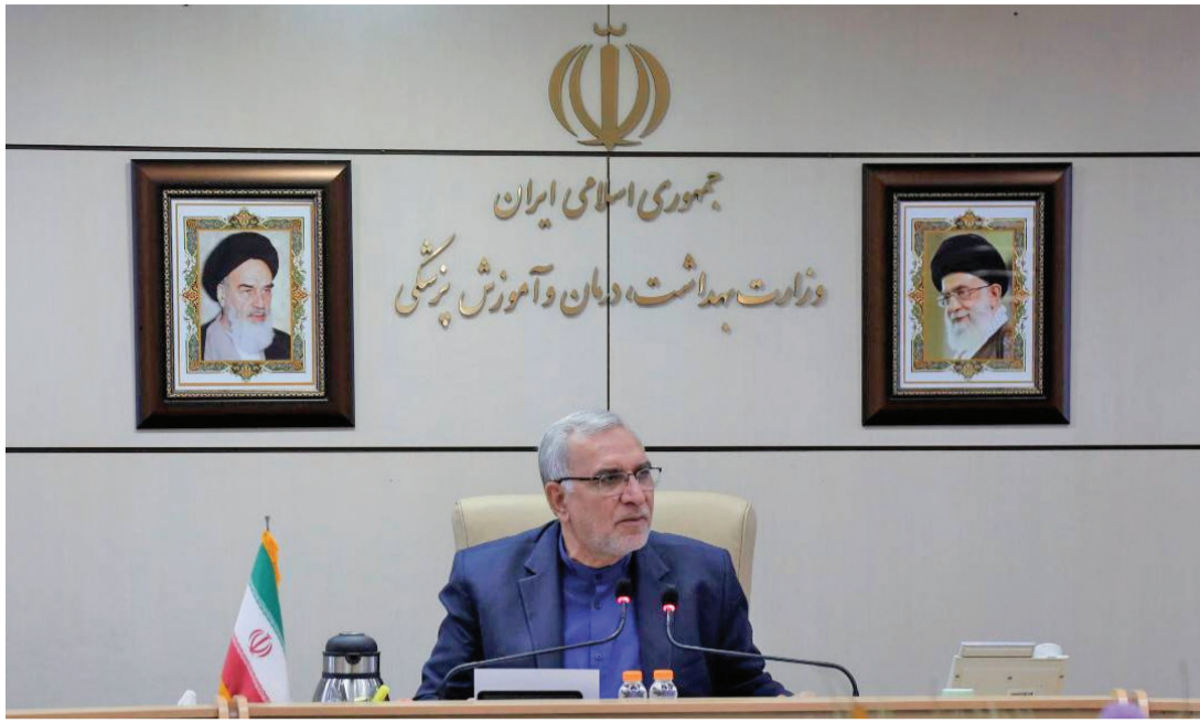
Health Minister Bahram Einollahi

TEHRAN – Iran is planning to send special envoys as health attachés to certain countries in Africa and Latin America.