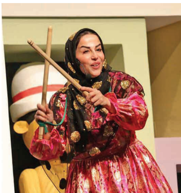
In Sign Language section, the storyteller tells the story in Persian sign language.

In the Traditional and Ritual section, the traditional and religious stories will be narrated through Naqqali [Iranian dramatic story-telling] and Pardeh khani (literally means reading off the screen/curtain).