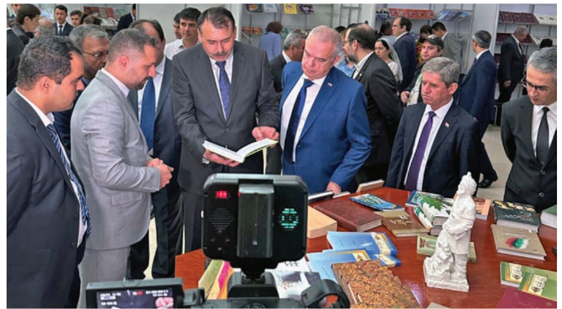
Tajik and Russian officials visit Iran pavilion at Dushanbe International Book Exhibition in Tajikistan on October 3, 2023.