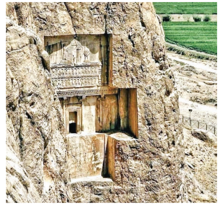
The rock-cut tomb at Naqsh-e Rostam, north of Persepolis, copying that of Darius the Great, is usually assumed to be that of Xerxes.

carvings above the tomb chambers that are similar to those at Persepolis, with the kings standing on thrones supported by figures representing the subject nations below. There are also two similar graves situated on the premises of Persepolis, probably belonging to Artaxerxes II and Artaxerxes III.