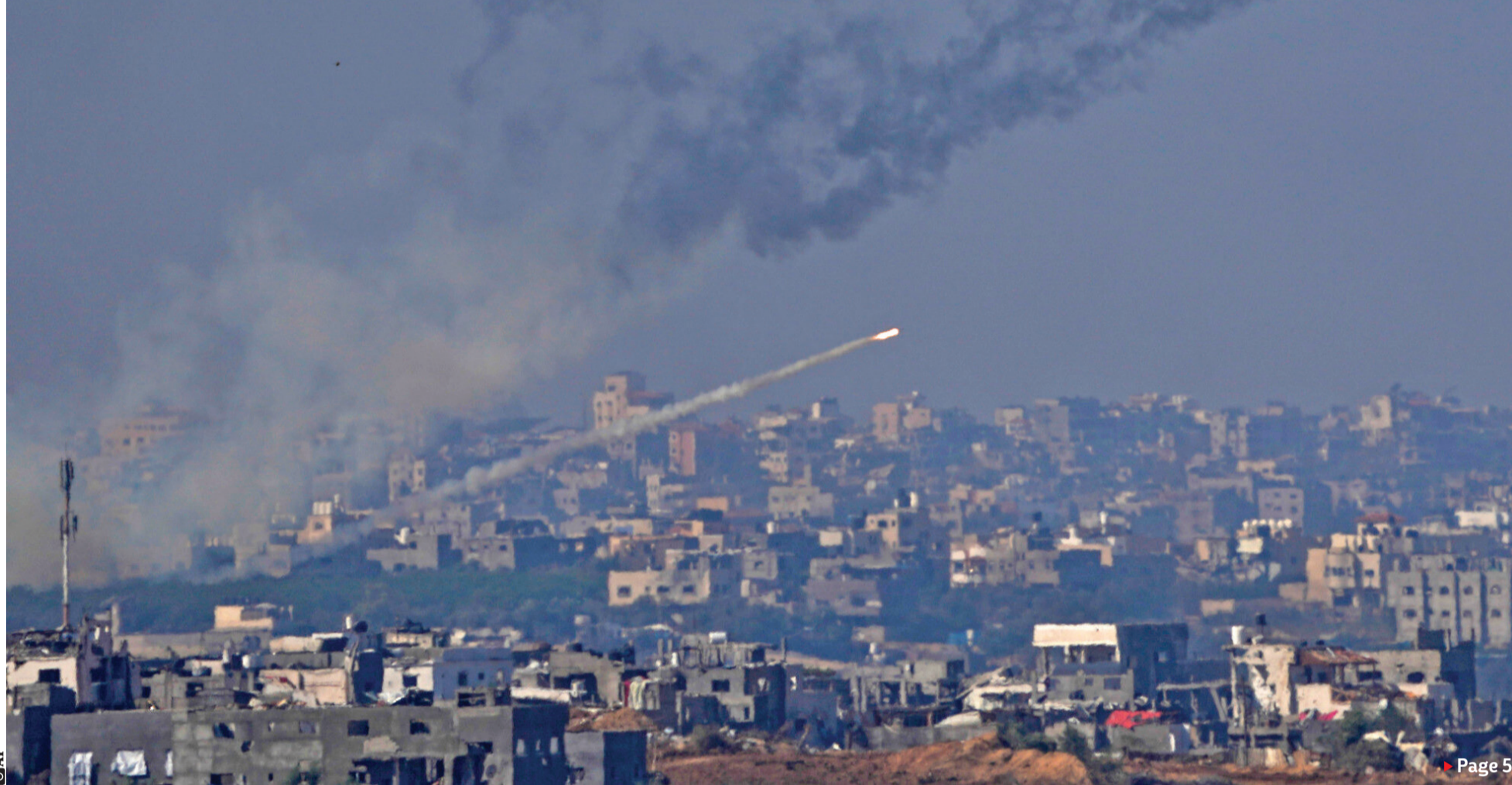
Rockets are fired toward Israel from the Gaza Strip, as seen from southern Israel, Friday, Dec. 1, 2023.