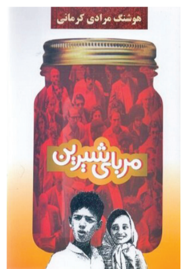
TEHRAN-The 41st edition of the Iranian writer Hushang

Moradi Kermani's children's book "A Sweet Jam" has recently been published.