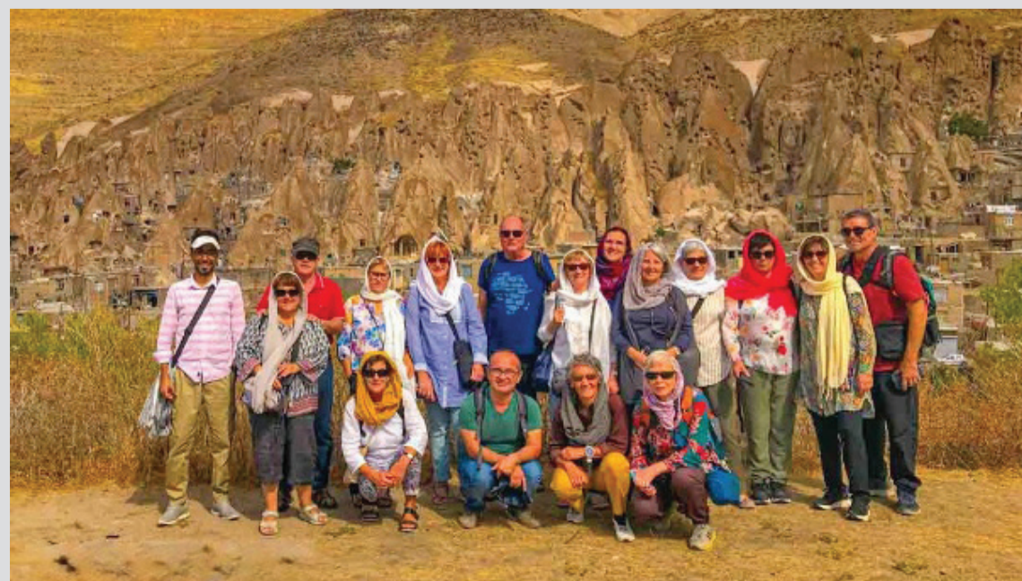
A group of international travelers pose for a photo with arrays of ancient rock-carved houses seen in the background in Kandovan village of Ardabil province, northwest Iran.