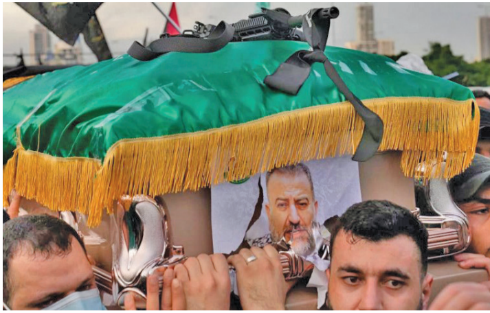
Tens of thousands gathered for senior Hamas leader Saleh al-Arouri's funeral in Beirut on Thursday.

Footage shows the armed wing of Hamas targeting a crowd of Israeli soldiers standing next to