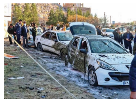
demning the terrorist attack.

The speakers of the parliaments of Qatar, the United Arab Emirates, and Oman expressed their condolences to the Iranian people, con-