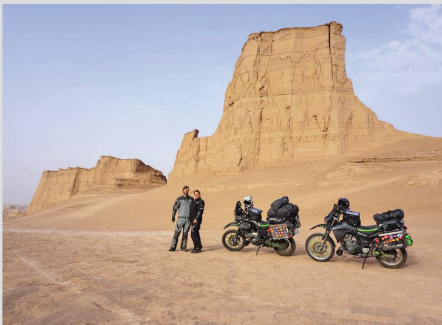
A foreign cyclist couple captures an essence of geological wonders sculpted by millions of years of wind and water erosion during their excursion to the UNESCO-designated Lut Desert in the heart of Iran.