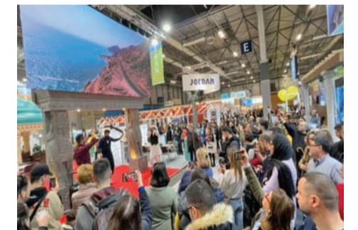
ism industry and lays the foundations for the consolidation of the sector during 2024.

As mentioned by organizers, the 44th edition of the International Tourism Trade Fair, FITUR, is set to reflect the growth experienced in recent months by the national and international tour-