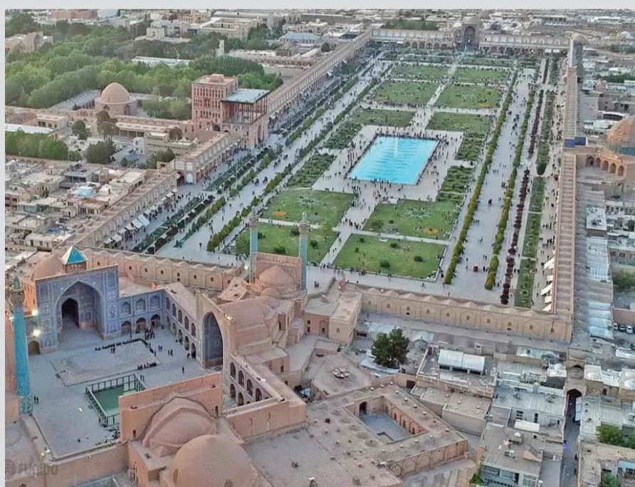
An aerial view of the UNESCO-designated Naqsh-e Jahan Square in Isfahan, where history whispers through the labyrinth of architecture.