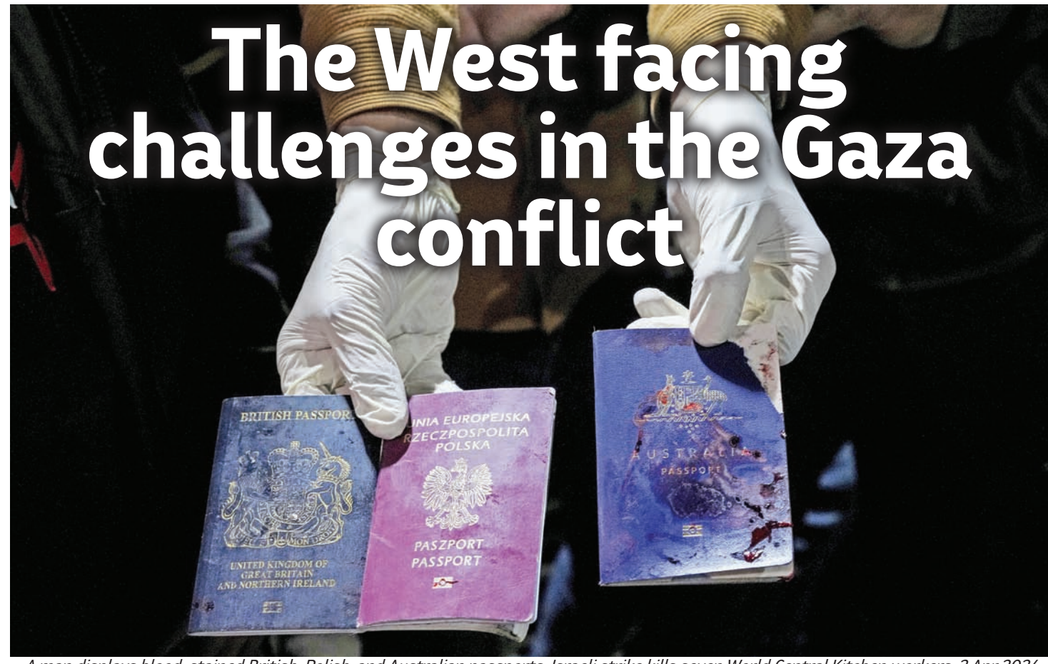
A man displays blood-stained British, Polish, and Australian passports. Israeli strike kills seven World Central Kitchen workers, 2 Apr 2024

But even before the Israeli genocide in Gaza began last October, there were growing numbers of demonstrators in the U.S., Europe, Asia and Africa marking Quds Day, with Muslims usually protesting after Friday prayers to draw attention to the ongoing occupation of Jerusalem. Today, Al-Quds Day rallies have become a global phenomenon.