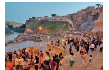
UN cultural body.

"The hydraulic system has been considered a Wonder of the World not only by the Persians but also by the Arab-Muslims at the peak of their civilization," according to the