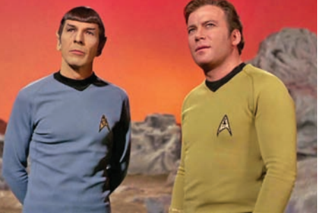
A scene from "Star Trek"

By imagining oneself as a rebel and collectively identifying with fantastic forms of victimhood, subjects who already enjoy social hegemony are able to justify economic inequality, expansions of police and military power, climate devastation, new articulations of racism, and countless other forms of violence—all purportedly in the name of security, self-defense, and self-protection.