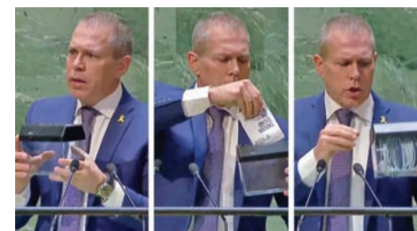
Israel's Ambassador to the UN Gilad Erdan destroys a copy of the UN Charter as he addresses delegates during the United Nations General Assembly in New York

The American public, every four years, are left to choose between a fox and a wolf, either way, they end up choosing a canine: the same people from the same class with the same worldview, representing the same interests. It is clear that the United States of America is a plutocratic system, regardless of whoever is in power, either Joseph Biden or Donald Trump, either the Democrats or Republicans, the US foreign and domestic policies remain the same: in service of vested business and political interests. This comes to show that, the United States which has, for decades, posed as the bastion of democracy and human