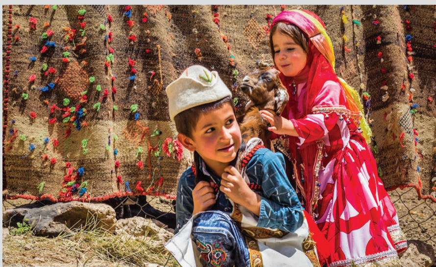
Nomadic children are seen in front of a simply-ornated tent at the foot of the Zagros Mountain range. In their playful innocence, they carry forward the rich heritage of their Turkic ancestors, preserving a timeless way of life.