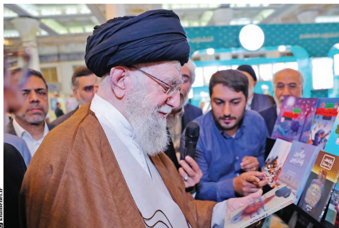
Leader Ayatollah Ali Khamenei is looking at a Lebanese novel titled "Tel Aviv Collapsed" translated from Arabic into Persian.

With approximately 15,000 households and a population of around 80,000 people in Ardabil province, this annual migration remains a touching reminder of the timeless traditions that have shaped the region for centuries. Page 6