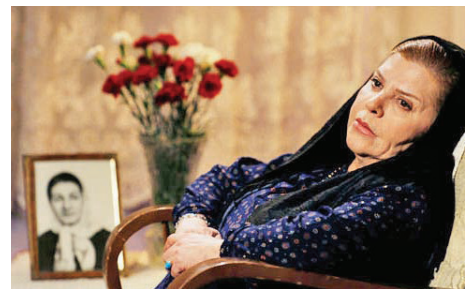
for her performance in the Oscar-winning film by Asghar Farhadi "A Separation".