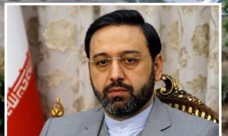
East Azerbaijan Province Governor Malek Rahmati