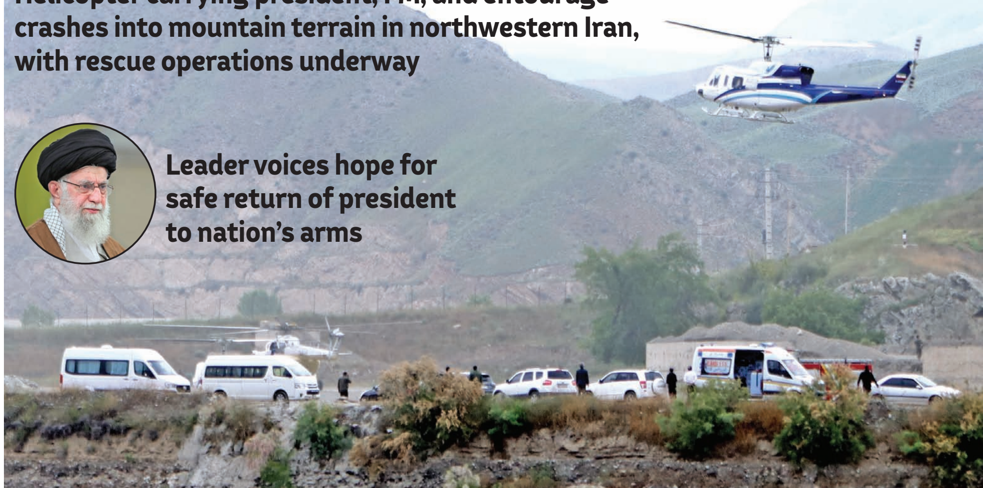
The helicopter carrying President Raisi and the accompanying delegation takes off from the Giz Galasi Dam area at noon on Sunday, May 19, 2024. ▶ Page 3