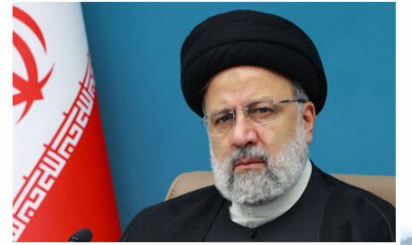
President Ebrahim Raisi

Leader voices hope for safe return of president to nation's arms