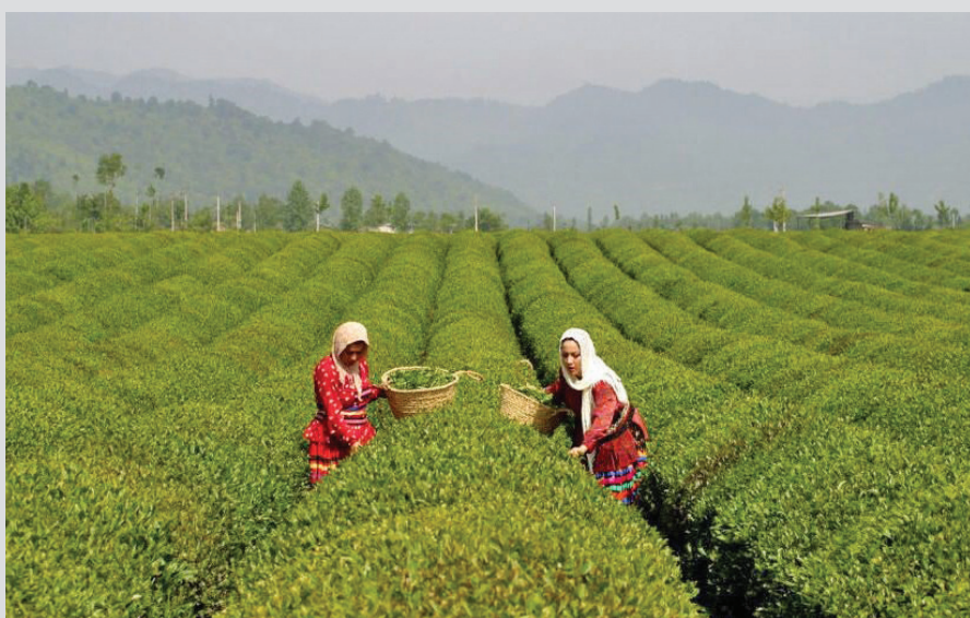
Farmers meticulously cultivate tea leaves in a vast field near Lahijan, Gilan province.