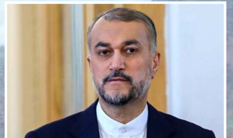
Foreign Minister Hossein Amir Abdollahian