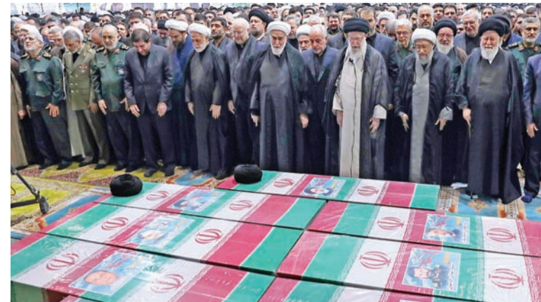
Ayatollah Khamenei performing the funeral prayer in Tehran on Wednesday, May 22, 2024, on the bodies of President Ebrahim Raisi and Foreign Minister Hossein Amir Abdollahian along with other victims who lost their lives in the recent helicopter crash.