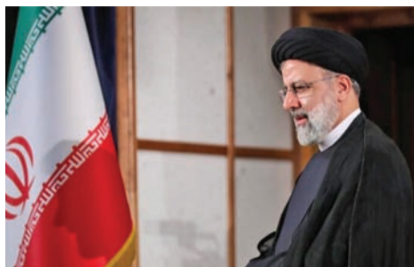
The late Iranian President Ebrahim Raisi in an undated photo