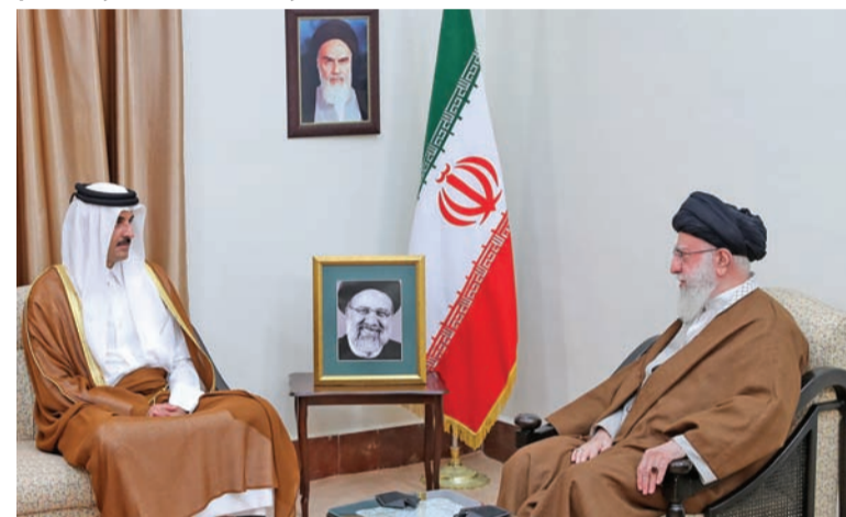
Qatari Emir Sheikh Tamim bin Hamad Al-Thani meeting Ayatollah Seyed Ali Khamenei, the Leader of the Islamic Revolution, in Tehran on Wednesday, May 22, 2024.