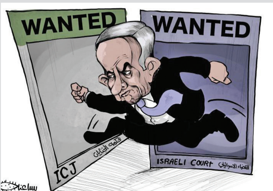
Netanyahu