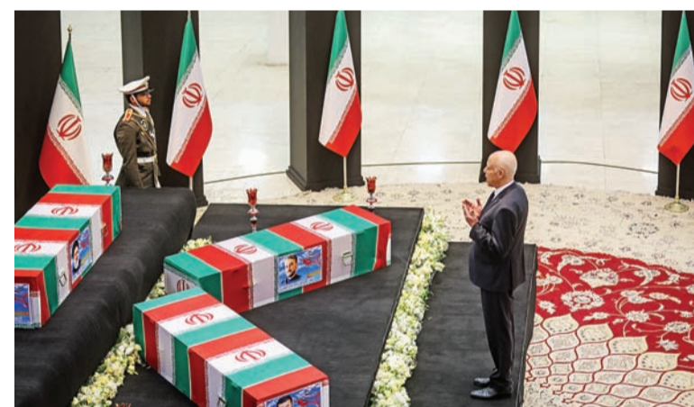
Tunisian President Kais Saied paying homage to President Raisi, Foreign Minister Amir Abdollahian, and the head of their security detail during his visit to Tehran on Wednesday, May 22, 2024.