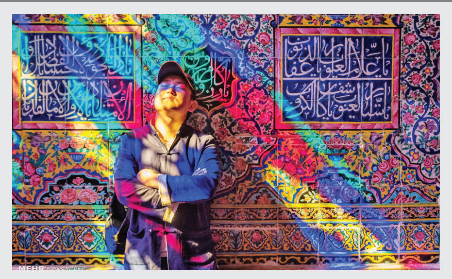
Sunlight, passing through mosaic windows, paints a tourist's face, in Nasir al-Mulk mosque, Shiraz.