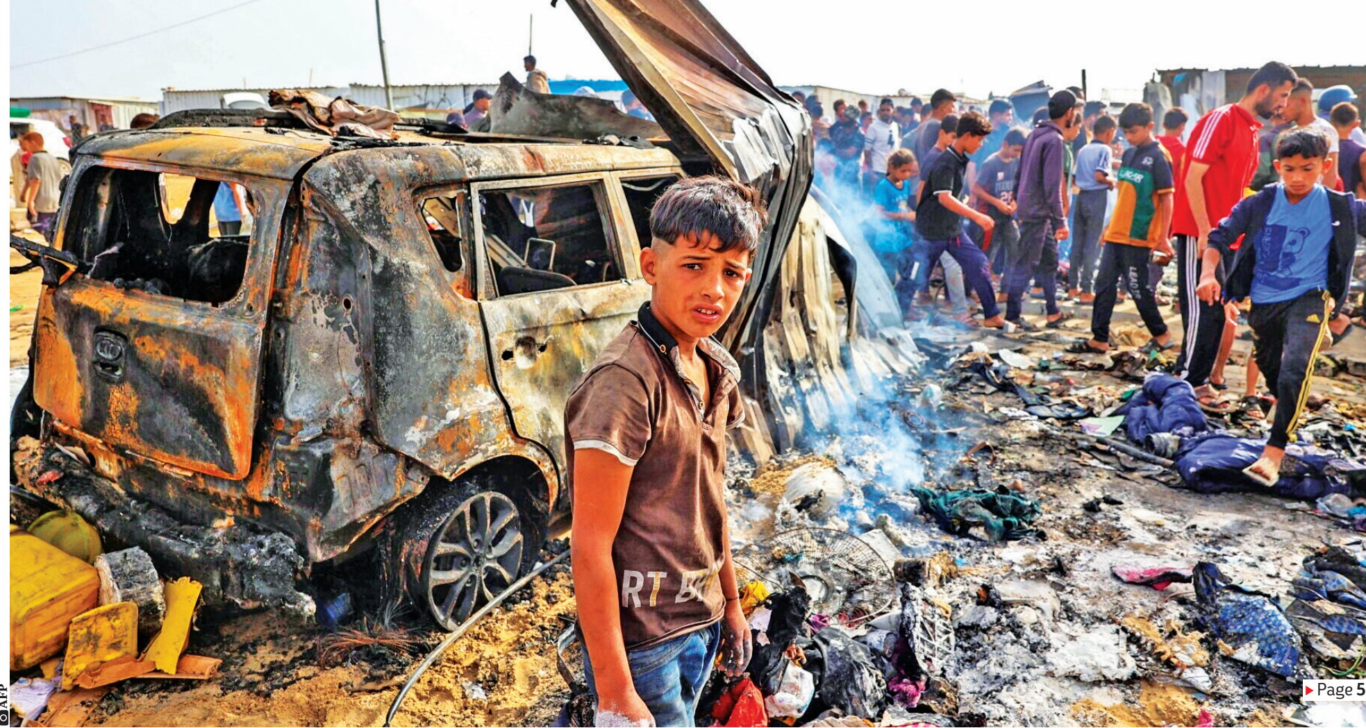
Palestinians gather at the site of an Israeli strike on a camp area housing internally displaced people in Rafah on May 27, 2024.