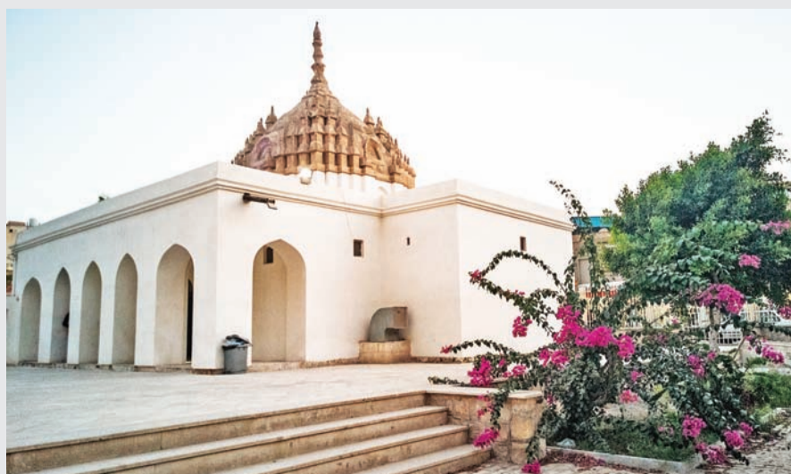
The Hindu Temple (aka Bot Gooran), a historical monument with a unique Indian-inspired architecture constructed in 1310 AH in Bandar Abbas, Iran.