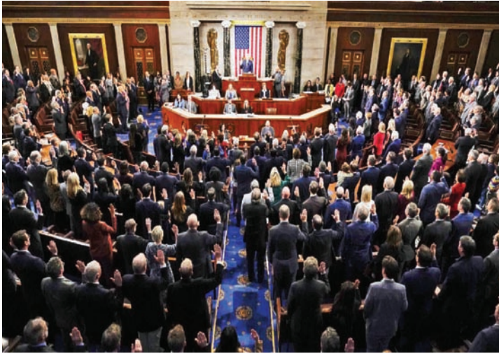
House puts the spotlight on their ulterior motives.

So, opposition to the GOP-led effort by the majority of the Democratic lawmakers and the White