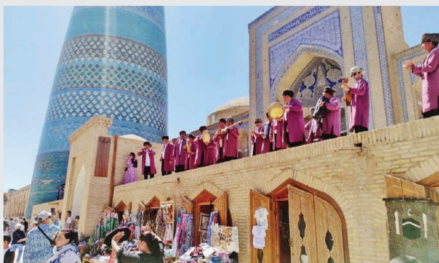
Local people in Khiva, Uzbekistan, along with international visitors, celebrate the ancient city's designation as the Tourism City of the Islamic World for 2024.