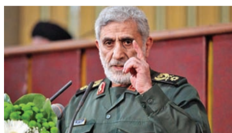
Resistance multiple times while emphasizing that it has no say in local forces' decisions.