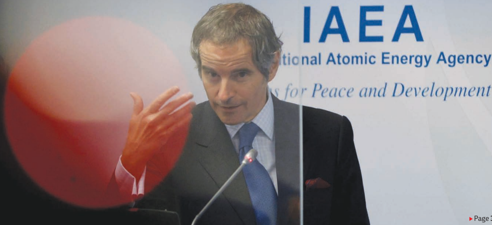
International Atomic Energy Agency (IAEA) Director General Rafael Grossi attends a news conference during a board of governors meeting at the IAEA headquarters in Vienna, Austria, June 7, 2021.

IAEA Board passes European trio resolution against Iran