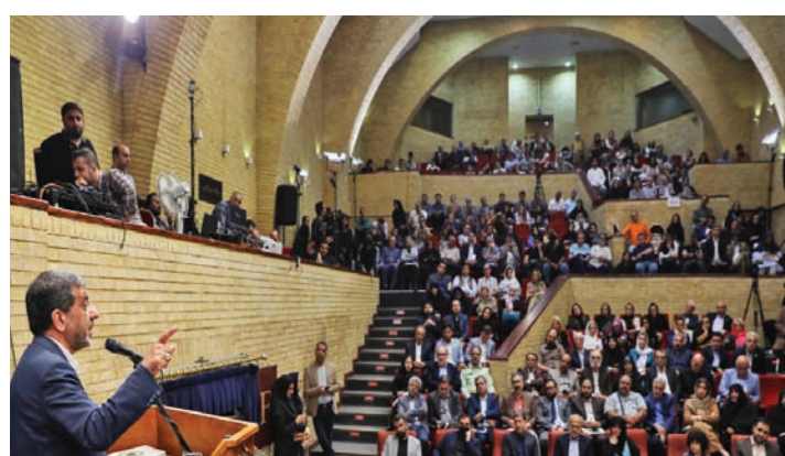
Iranian tourism minister Ezzatollah Zarghami addresses a conference held in the ministry's headquarters to celebrate World Handicrafts Day, June 8, 2024.