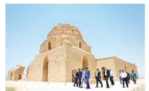
Sarvestan which are amongst the highlights of the ensemble.

The Sassanid era is of very high importance in the history of Iran. Under Sassanids, Persian art and architecture experienced a general renaissance. Architecture often took grandiose proportions such as palaces at Ctesiphon, Firuzabad, and