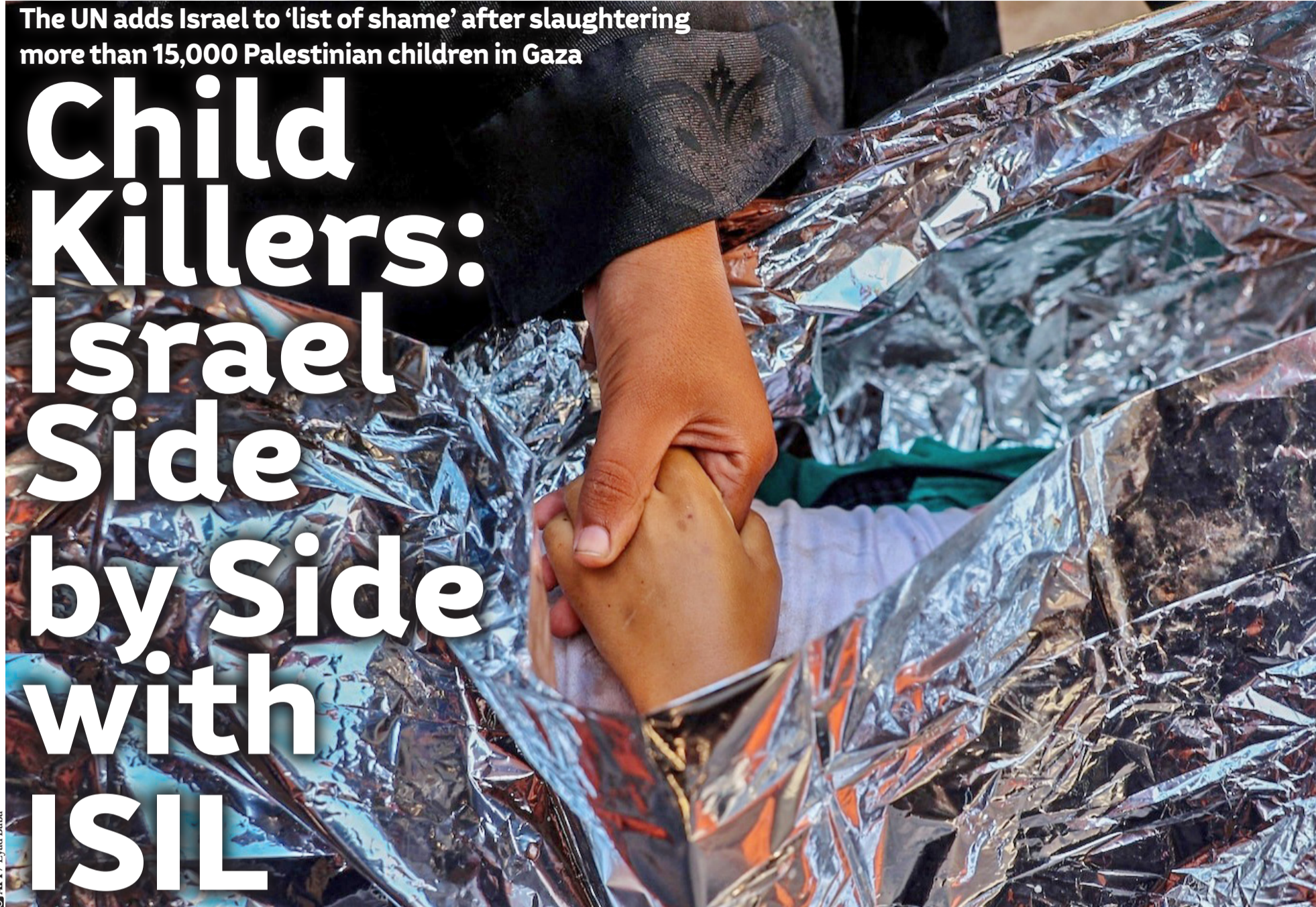
A woman holds the hand of a boy killed in an Israeli airstrike at a UN school housing displaced Palestinians in Nuseirat, at a hospital ground in Deir el-Balah, June 6, 2024.