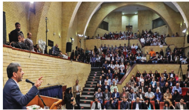
Iranian tourism minister Ezzatollah Zarghami addresses a conference held in the ministry's headquarters to celebrate World Handicrafts Day, June 8, 2024.