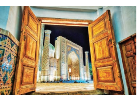
A door opening to centuries-old monuments in Samarkand's Registan Square

Samarkand, a name that resonates with history and grandeur, exceeded all my expectations.