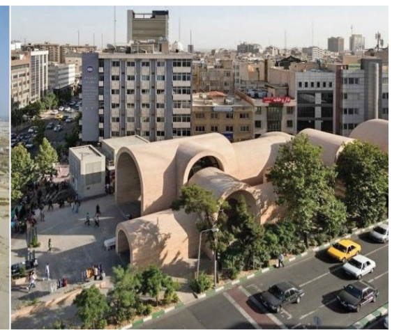
Jaldag Elementary School in Sistan-Baluchestan Province (L) and Jihad Metro Plaza in Tehran