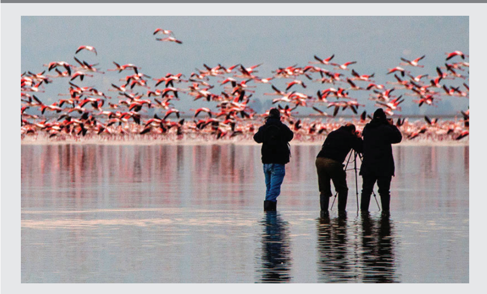
Birdwatchers eagerly capture the beauty of migratory birds at Miankaleh Peninsula in the northern Mazandaran province.