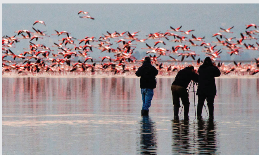
Birdwatchers eagerly capture the beauty of migratory birds at Miankaleh Peninsula in the northern Mazandaran province.