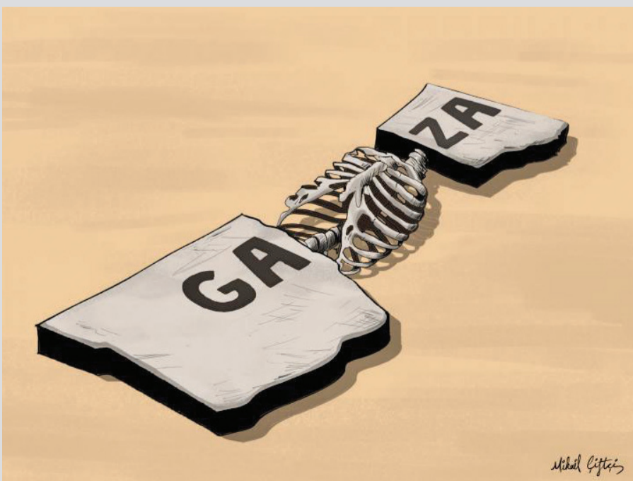
Starvation in Gaza Cartoonist: Mikail Çiftçi from Turkey