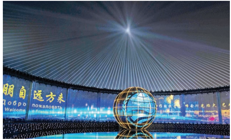
A lights and fireworks show takes place in Qingdao, the host city of the 18th Shanghai Cooperation Organization summit, in east China's Shandong Province, June 9, 2018.

Xi's proposals are playing a very crucial role in building mutual trust