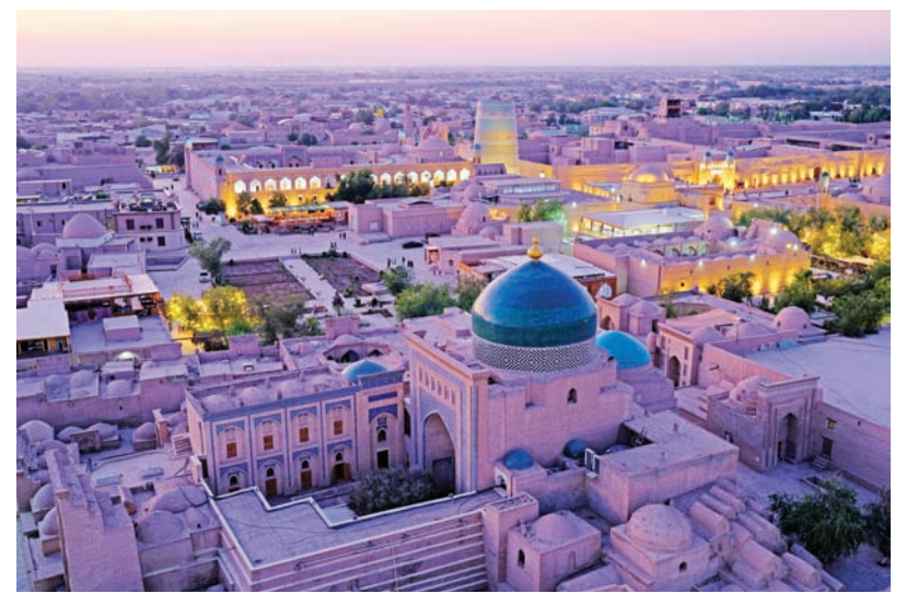
This photo taken on Sept. 21, 2023 shows the historical sites in the ancient city of Khiva, Uzbekistan.

He also urged the SCO members to help Afghanistan regain peace and