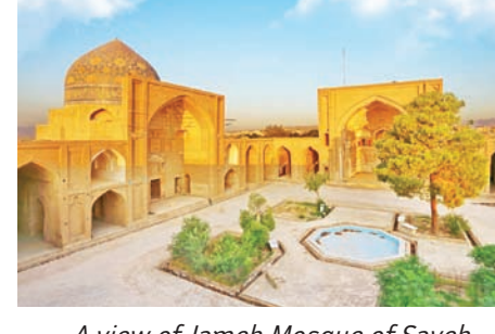
A view of Jameh Mosque of Saveh

The deputy minister also highlighted the role of civilians in safeguarding the country's cultural heritage. He then highlighted the formation of a cultural heritage benefac-