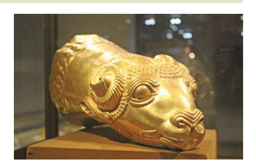
Golden rhyton of ram's head, discovered in Ecbatana, kept at the Reza Abbasi Museum in Tehran.

Hegmataneh, aka Ecbatana in Western sources, is universally well-known for being the site where the Median Dynasty was established. Following the Medes, this city also served as the capital of the Achaemenid Empire. During subsequent periods, including the Seleucid, Parthian, Sassanid, and Islamic