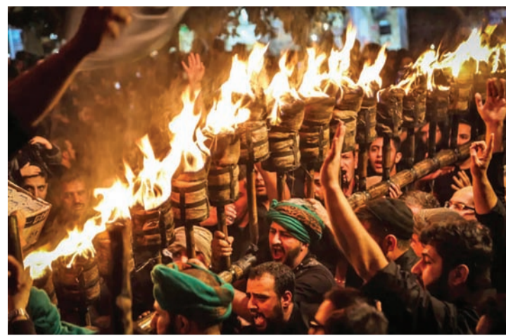
While carrying the torch, or Mashal, the men sing the song of mourning, called Nohe

Symbolically, the torches carried during Mashal Gardani represent the flames that engulfed the tents of Imam Hussain (AS) and his followers. The loud beating of drums serves as a haunting reminder of the sounds made during the attack by Yazid's and Ibn Ziyad's forces, aimed at drowning out the cries of the women and children.