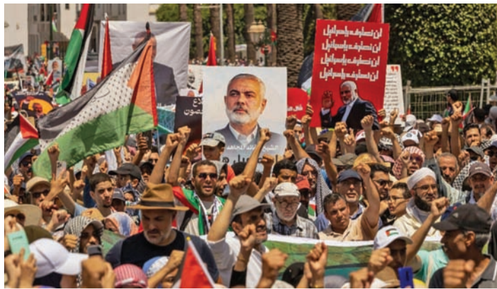
Similar protests were also held in Lebanon, Jordan and some other countries including the UK.

The Turkish city of Istanbul also saw anti-Israel protests. The demonstrators condemned Haniyeh's murder and Israel's atrocities in Gaza.