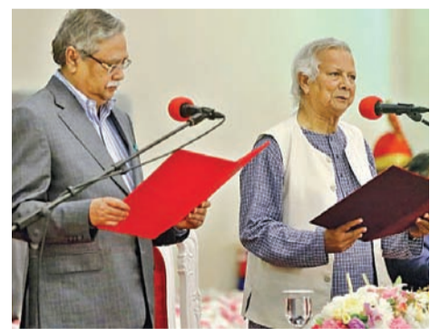
Muhammad Yunus takes oath as head of Bangladesh's interim government at a ceremony in Dhaka on August 8, 2024.

TEHRAN- The spokesman for Iran's Ministry of Foreign Affairs welcomed the formation of an interim government in Bangladesh headed by Muhammad Yunus.