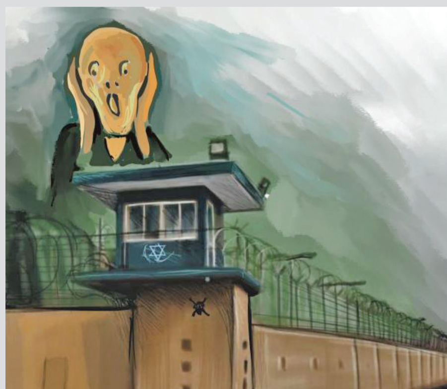
The Israeli Prisons